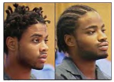
The Carr brothers.

The three men and one of the women died but one woman survived a bullet wound in the back. After the killers left,