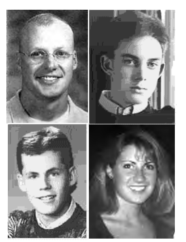
Four of their victims.