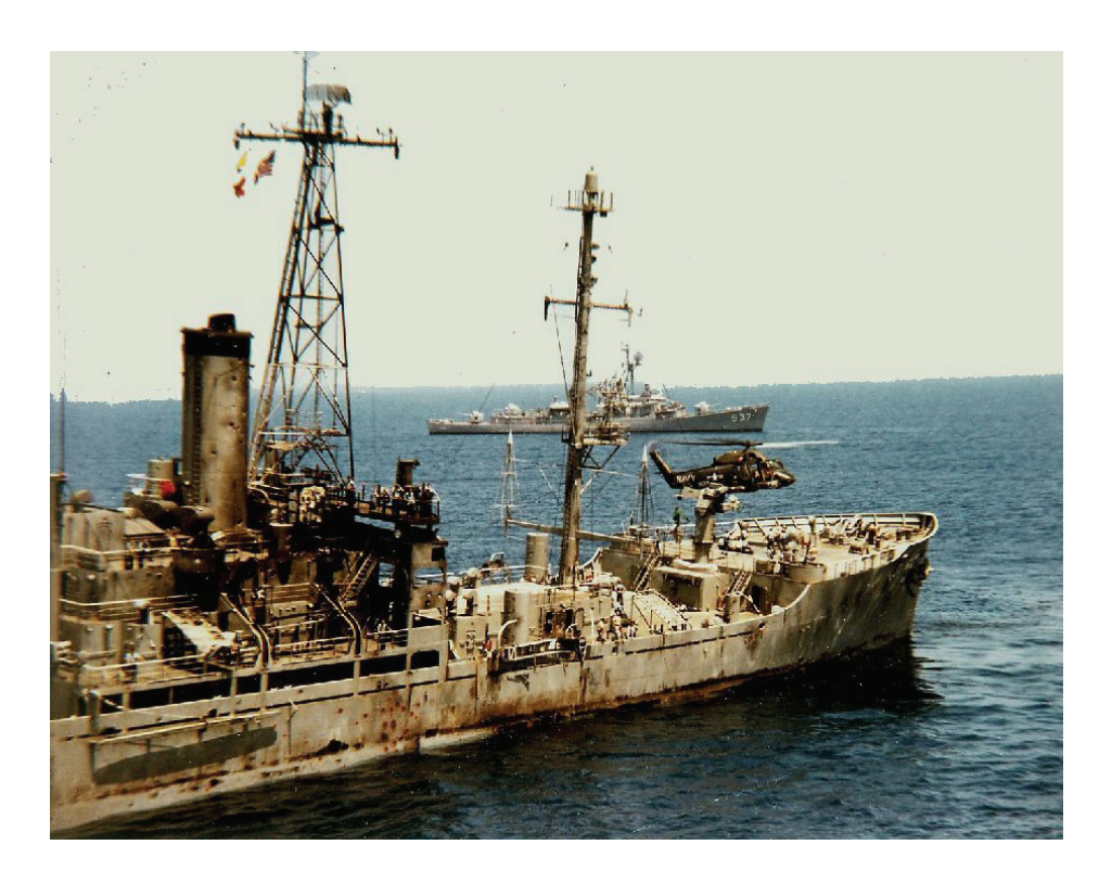
U.S.S. Liberty, Riddled by Israeli Fighter Planes