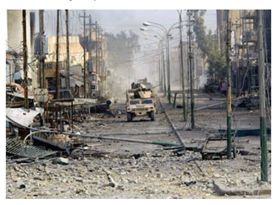
Major city of Falluja laid to waste by U.S. Military