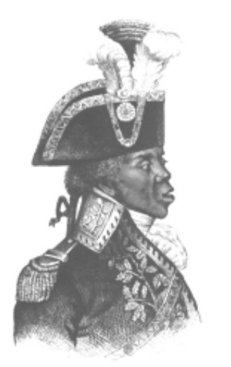
The Haitian George Washington.

In 1803, an army of Haitian former slaves drove the French army out of Haiti (the soldiers were dying of yellow fever) and massacred the remaining whites. Toussaint Louverture, the hero of the revolution, died in a French prison a few months later. Thirty-five years later, the French government agreed to recognize Haitian independence in exchange for 90 million francs in gold to compensate French landowners who lost property.