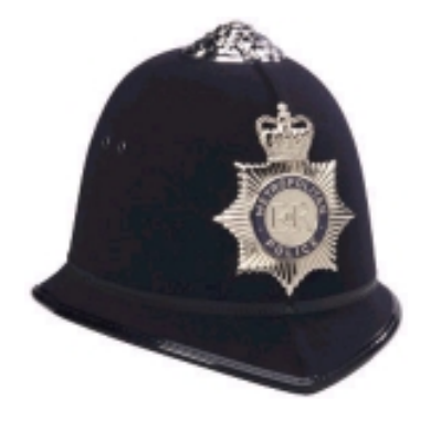
more. On June 16, assistant police commissioner Bernared Hogan-Howe announced a new recruiting tactic: Muslims may wear turbans instead of the tra-

Only two percent of the London Metropolitan Police force's 28,000 officers are Muslim, so clearly the city needs