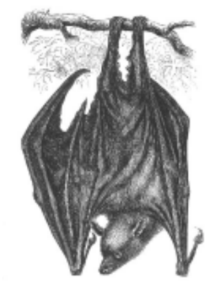
Another treat for the barbie.

probably started in wild animals and switched to humans. It now appears likely that the recent outbreak of SARS got its start from the close contact between Chinese animal merchants and their wares. The people of Guangdong Province in southern China are famous for eating "everything with four legs except a table, everything that flies except an airplane, and everything that swims except a submarine," and support a brisk trade in cats, snakes, bats, dogs, civet cats, pangolins, and anything else hunters can get their hands on. People