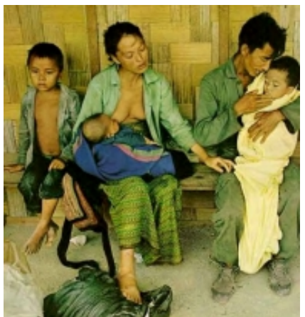
Hmong . . . or are they Mong?