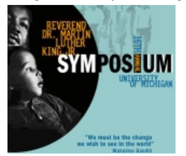
Minorities must be made to feel at home.

This last is interesting on several counts. First, can we really expect sharp disagreement among blacks about "the legacy of slavery," "400 years of oppression," or "institutional racism," which are, presumably, the areas on which their privileged perspective is meant to throw special light? How many blacks are go-