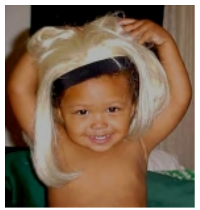
Already trying to be blonde?