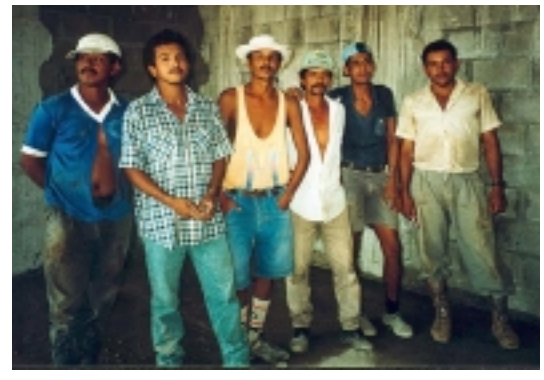
They head north.

Is there really as much anti-immigrant sentiment among Hispanics as K.B. Forbes claims? If there is, it is probably