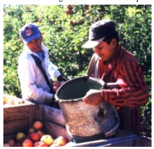
Hispanics don't want them here either?

is not much sign of Hispanic resistance to immigration, but claimed that many Hispanics are completely "red, white and blue" and that Hispanic opposition to immigration is a "sleeping giant" beginning to stir. He seemed entirely sincere he got a good round of applause when he said all illegals must be rounded up