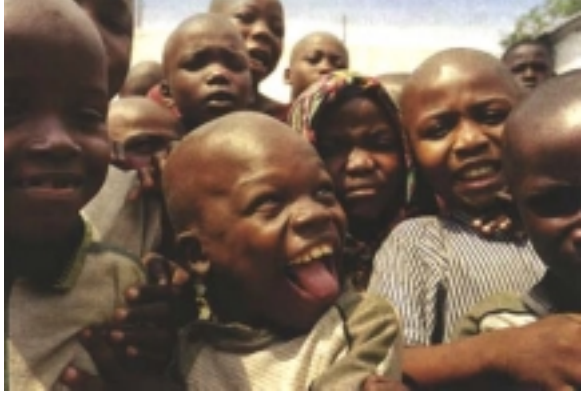
Congolese child witches.

this; "There's a growing interest in how people perceive themselves nationally" says a spokesman. Now, when Britons fill out government forms, surveys and job applications, they can describe themselves as "white English" or "Afro-Car-