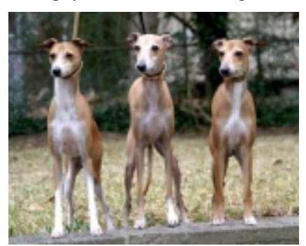
... but are genetically almost indistinguishable.

Comparisons with monkeys underscore the significance of human races. A series of measurements on skulls yields an index of difference from one population to another. By this measure, human races are as different from each other as are different species of chimpanzee. In fact, a comparison of the most widely divergent human groups, such as Norwegians and Australian Aborigines finds physical differences as great as