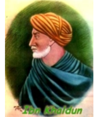
He didn't like them either.

Arabs launched the earliest slaving missions across the Sahara, and quickly