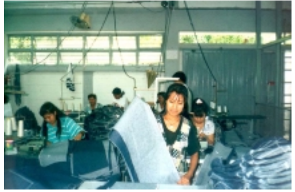
Jobs heading south: Mexican maquilladora.

man who is a gynecologist and still has a practice. He got a big laugh when he imitated a thick Southern accent, and quoted his colleague: "I have done an informal poll of my patients and have found that amnesty is about as popular as genital herpes."