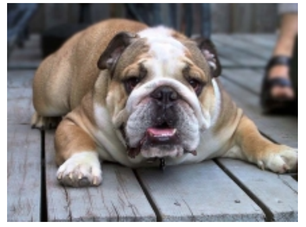
Dog breeds vary tremendously ...

Furthermore, this particular "illusion" is proving to have very concrete uses. Police can now easily test DNA samples