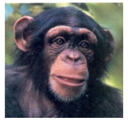
Some human groups are physically ...

"Human races are very strongly marked morphologically; human races are very young; so much variation developing in so short a period of time implies, indeed almost certainly re-