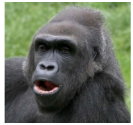
... as dissimilar as chimps and gorillas.

ministrative consideration of race, with employers and colleges free to make decisions strictly on merit. Presumably they support repeal of all anti-discrimination laws, which would leave businesses free to choose their customers and homeowners their neighbors. This book says nothing about immigration, but a meritocratic approach presumably means restrictions based (only) on ability.