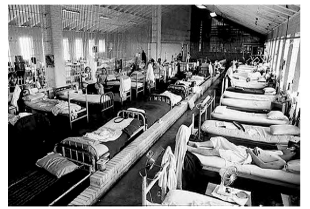
Open dormitory in a Texas prison.

"I had no choice but to submit to being Inmate B's prison wife. Out of fear for my life, I submitted to sucking his dick, being fucked in my ass, and performing other duties as a woman, such as making his bed. In all reality, I was his slave .... I determined I'd be better