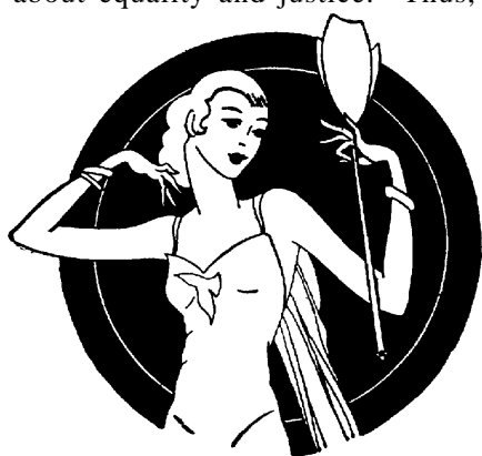
White skin privilege.

The "crits" do not yet control society but they control what they teach: "All aspects of the curriculum [must] integrate multicultural, critical thinking and justice concepts and practice." "Diversity and equity issues are integrated into all aspects of the teacher-training curriculum." This is necessary because, as one of the editors of the book puts it with breath-taking finality, "The purpose of education in an unjust society is to bring about equality and justice." Thus,