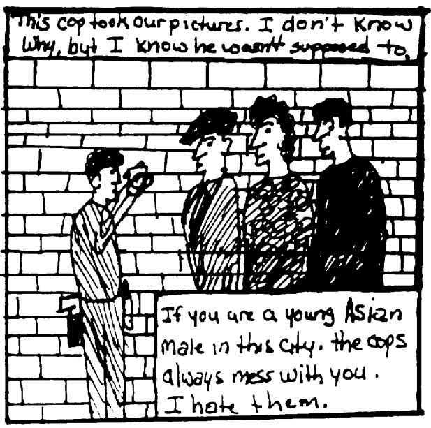
Inspirational anti-racist cartoon.

"huts." Likewise, to speak of "slaves" and "masters" implies that status is inherent. It is better to speak of "enslaved Africans," and really "transformative"