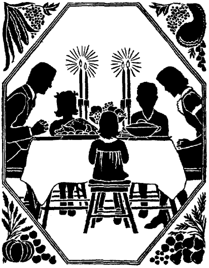
National day of mourning?

Once children are older, there are countless techniques for attacking "the dominant culture," and the book suggests particularly lively ways to take the stuffing out of whites. Children can pretend to be Congressmen debating the Indian Removal Act of 1830, or can try to think of all the evil motives for the Chinese Exclusion Acts of the 19th century. They should put on a mock trial of "the profit system" as the cause of the drug trade, as they consider "drugs as a weapon against the Black community." Students can draw cartoons about the "racism" they experience, or can collect tourist brochures about Hawaii and note that they fail to mention that whites seized the islands and raped the culture. They can discuss why Thanksgiving Day can be thought of as a day of mourning, or take turns answering the question: "What is your earliest recollection of being excluded because of your race or culture?" Whites can keep diaries of the unearned privileges they enjoy each