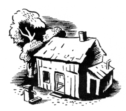
Now fully insurable.

• State Farm insurance and Allstate, two of the biggest home insurers, have been browbeaten into lowering underwriting standards in poor neighborhoods. Until recently, they did not insure houses that cost less than $40,000 or that were more than 40 years old,