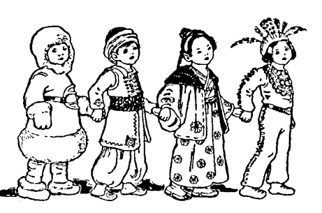
Little Turk or Japanee . . .

Until the 1950s or 1960s most Americans knew that they were white and that their country and culture were white. They took whiteness for