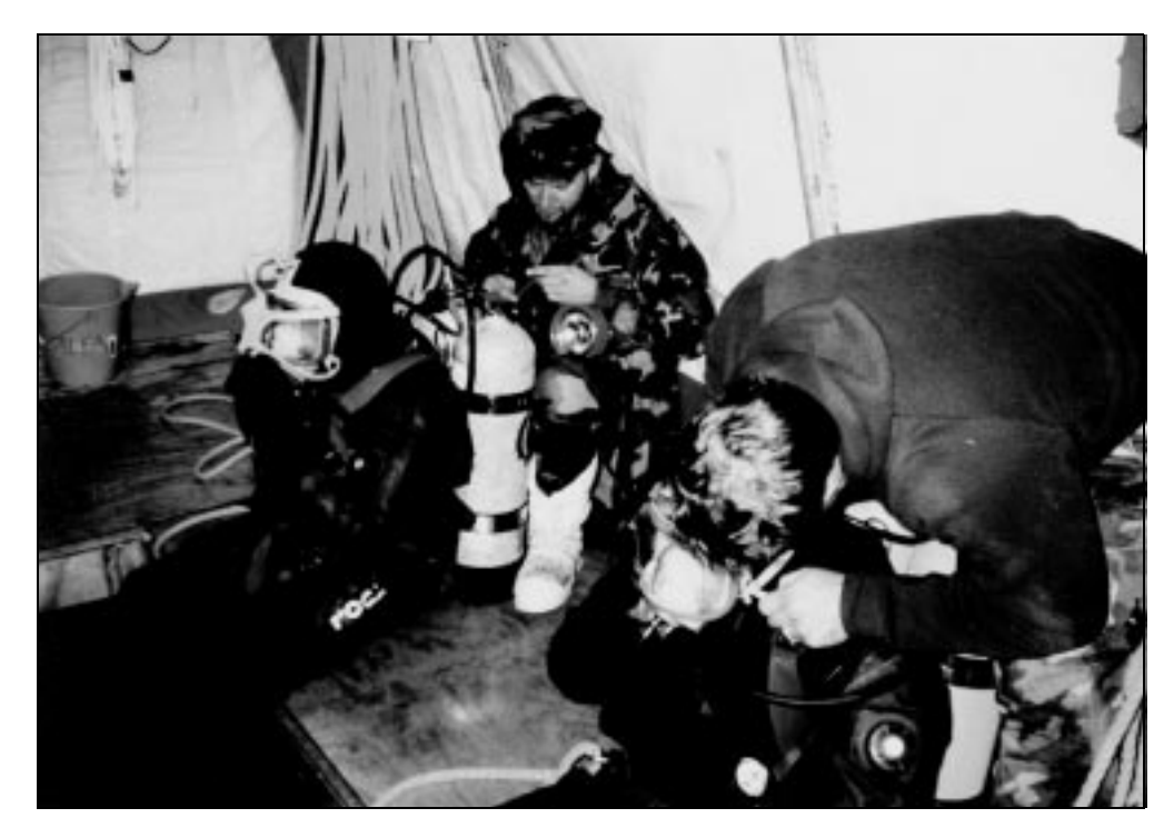
Figure 11-1. Ice Diving with Scuba. Divers in Typhoon dry suits and Aga/Divator FFM Scuba with approved cold-water regulators.