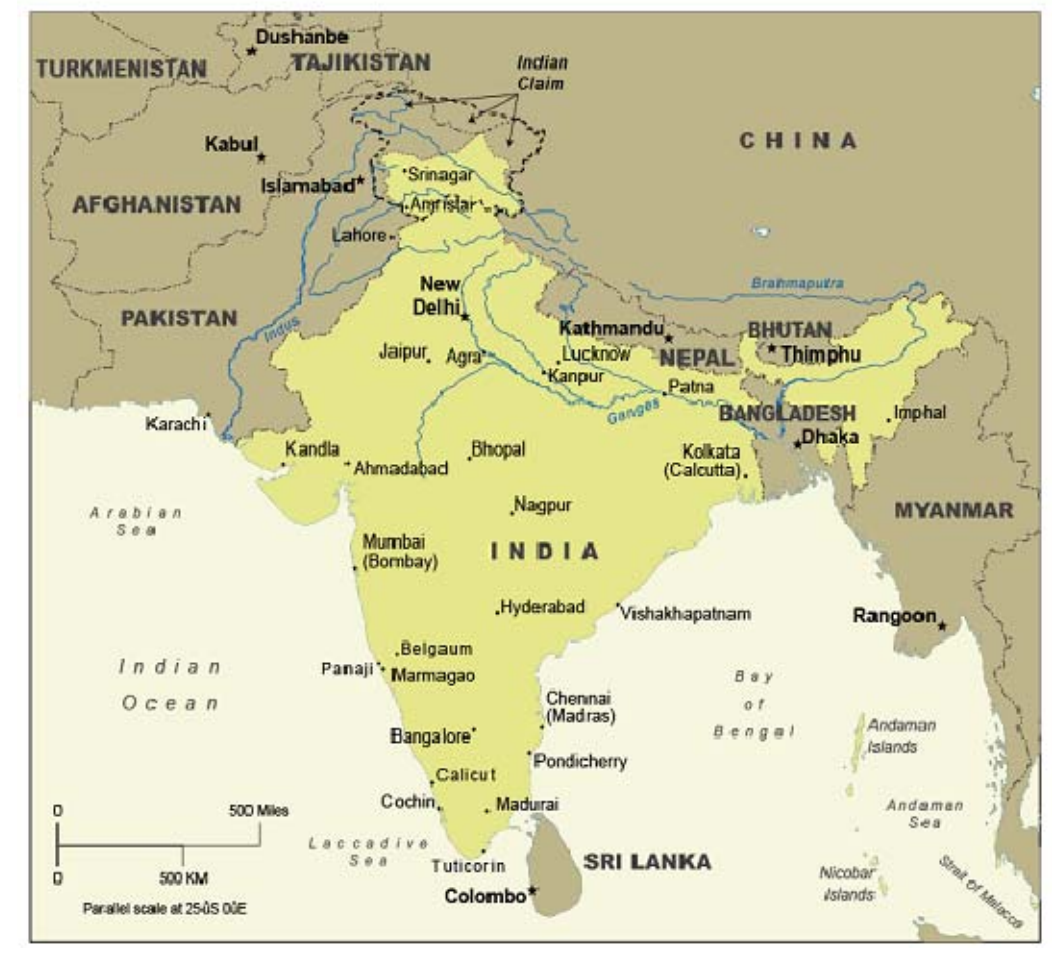
Figure 2. Map of India