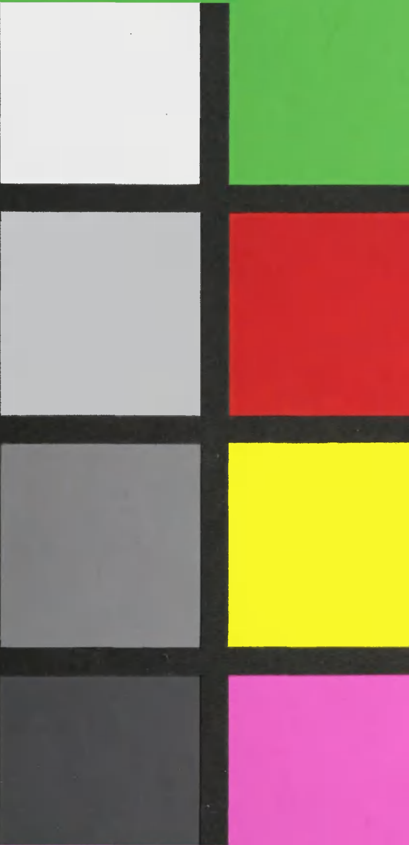
GretagMacbeth™ ColorChecker Color Rendition Chart