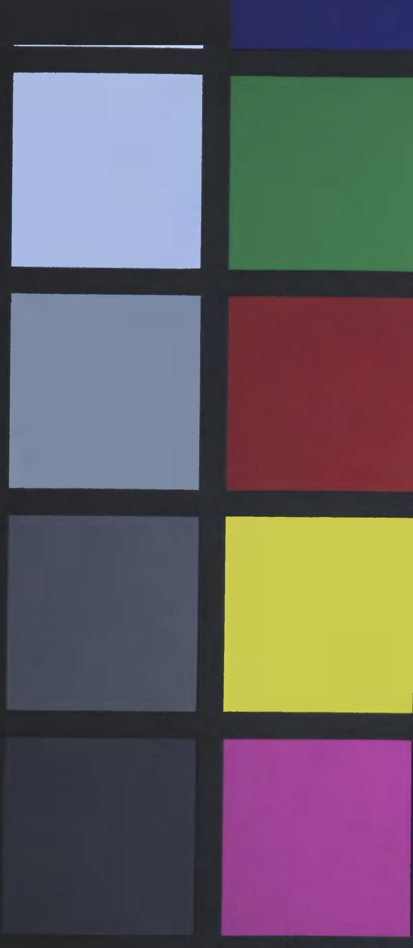
GretagMacbeth™ ColorChecker Color Rendition Chart