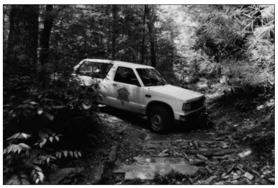
Officer encounters adverse physical conditions in isolated area.

Economic factors. High rates of poverty have long been associated with high rates of crime. Crime has been less frequent in rural areas, although poverty has been a common problem in rural America. For example, of the 159 high-poverty counties in the United States in 1979, only six contained a city with a population of 25,000 or more.<sup>43</sup> Further,