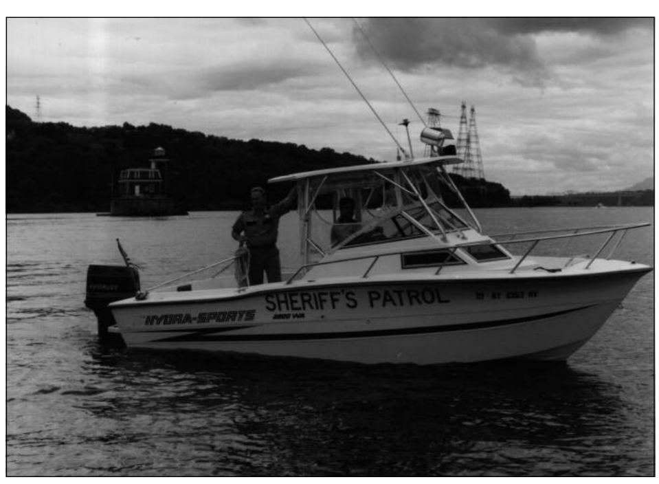
Rural patrol can include the Nation's inland waterways.

Even less is known about rural-urban differences in child abuse, but two studies by the National Center on Child Abuse and Neglect<sup>24</sup> suggest the issue is worth further study. The first study was conducted in 1980 and the second in 1986. The studies differed in one important respect. In the 1980 version, abuse was defined as "demonstrated harm as a result of maltreatment."<sup>25</sup> The 1986 study included a definition of abuse that mirrored the 1980 definition, but also in-