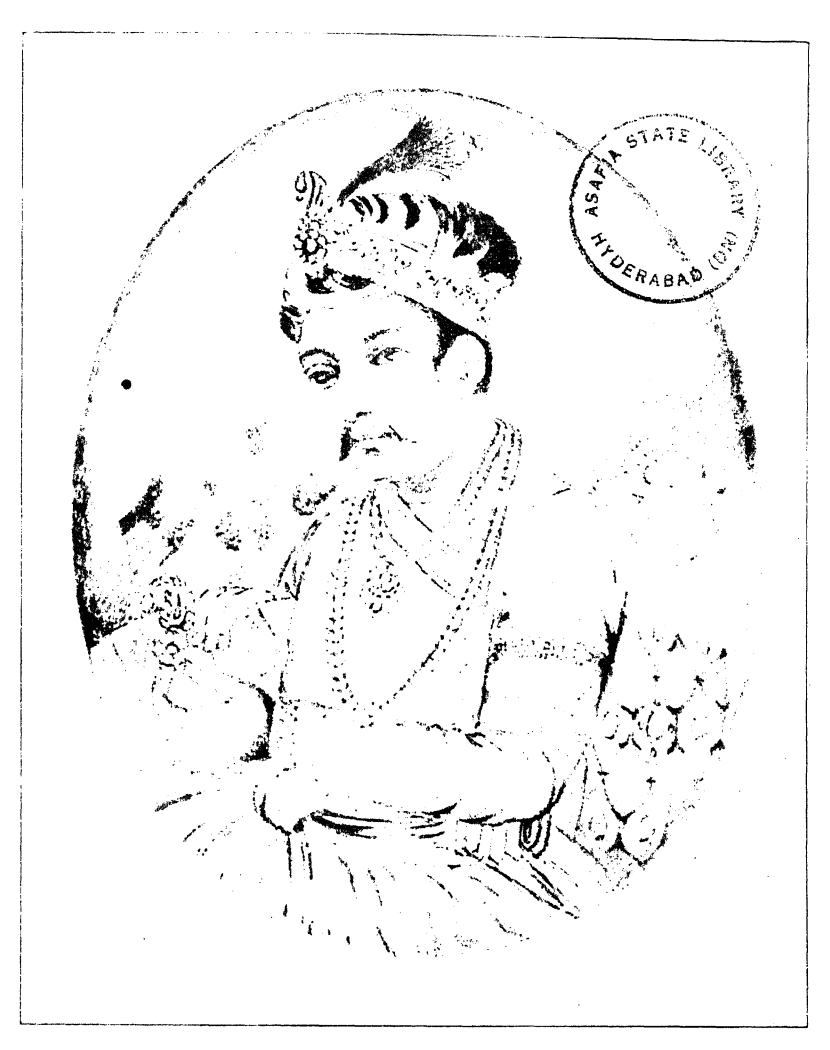
AKEAR, EMPEROR OF INDIA. From Noer's Kaiser Akbar, (Frontispiece to Vol. II).