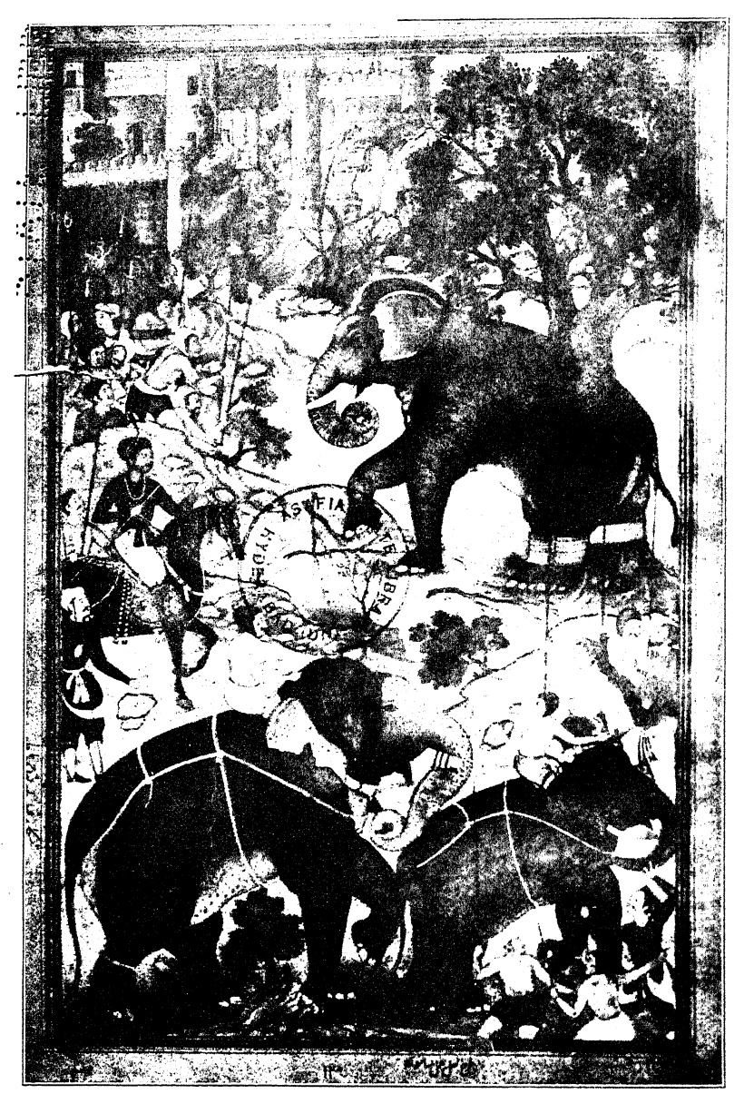
AKBAR DIRECTING THE TYING-UP OF A WILD ELEPHANT.