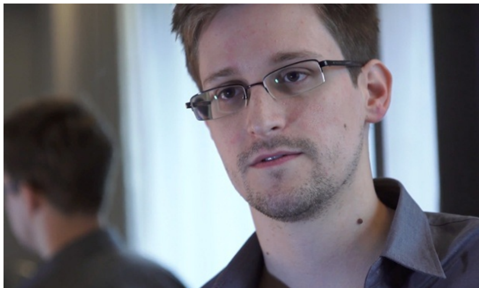
The NSA leaker, Edward Snowden, pictured in a Hong Kong hotel.

Sort by: Latest first Oldest first Auto update: On Off