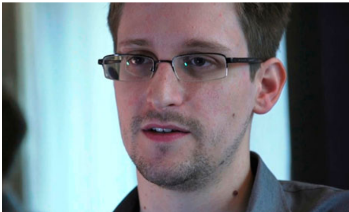
Edward Snowden.

theguardian.com, Monday 1 July 2013 23.17 BST