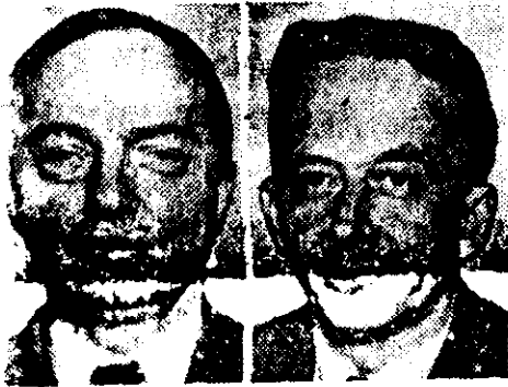
Dr. Harlow Shapley Philip C. Jessup

and unfair parallel in-ational in-ation in- that we nitewash" Depart- unfortuned in its failure of ers to at-ions with y. Out of or Senator y 21 ses- Senator y 22. Sig- percent- s occurred