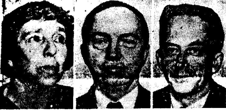
Miss Dorothy Kenyon Dr. Harlow Shapley Phillip C. Jessup

could not remember this subcommittee of any recollection... In addition, the community and voluntarily before the grand jury of 1945. After the facts, the grand jury voted not to indict. We could not be impressed also by the rigorous scrutiny to which he has been subjected during the past 5 years. He has been treated in various ways by either the State Department or the Personnel Loyalty Board.