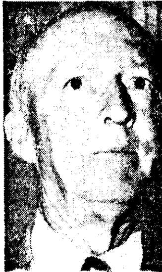
JUSTICE HUGO BLACK

"Thank God for a Supreme Court which has the courage in hours of hysteria to hold true to the basic rights of