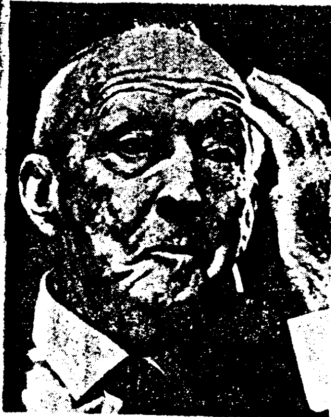
SOON TO BE 85 — Supreme Court Justice Hugo L. Black, who will celebrate his 85th birthday Saturday, relaxes in his office Thursday during an interview.