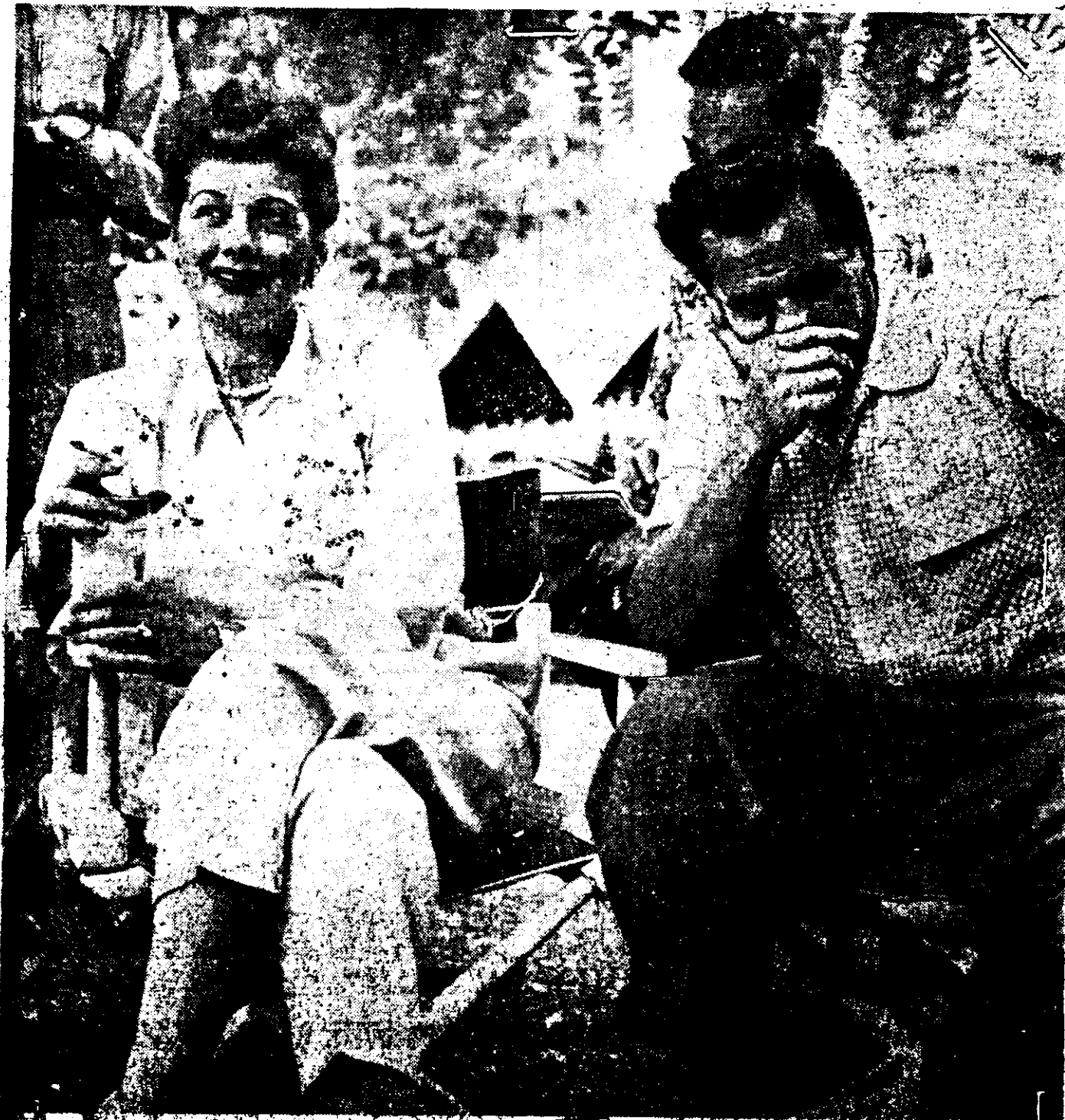
SMILE FROM LUCY - Actress Lucille Ball laughs as her husband, Desi Arnaz, contemplates an answer at their press conference yesterday. They met newsmen after her Red-link husband was released.