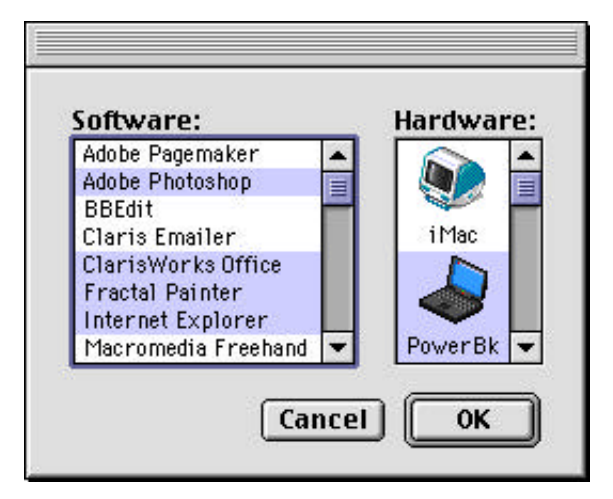
FIG 1 - DIALOG BOX WITH TWO LISTS

To create a list with graphical elements, such as the list at the right at Fig 1, you must write a custom list definition function (see below), because the default list definition function only supports the display of text.