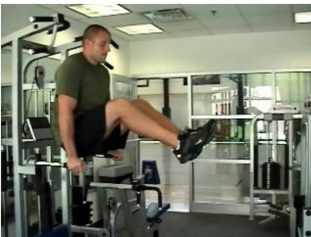
Single Leg Squat