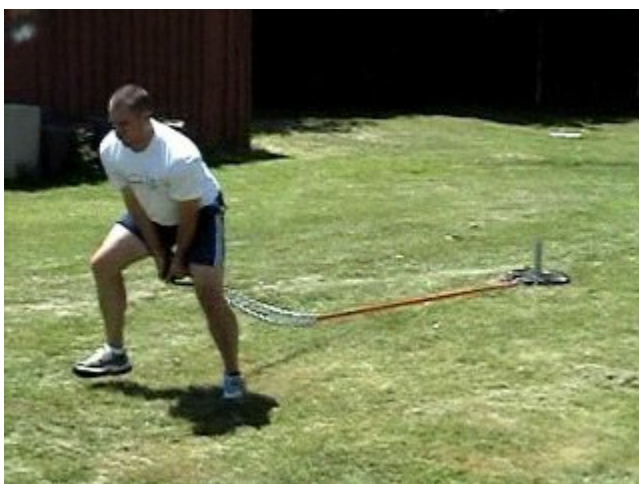
Sumo Pull Through