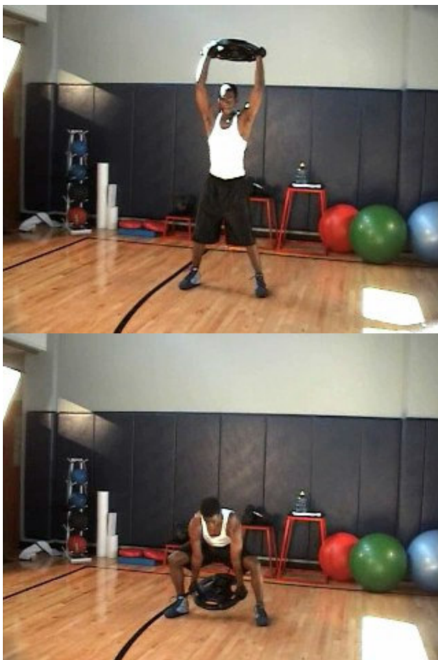
Weight Plate Rotational Lift & Press