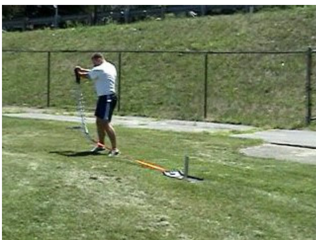
Diagonal Lift & Pull