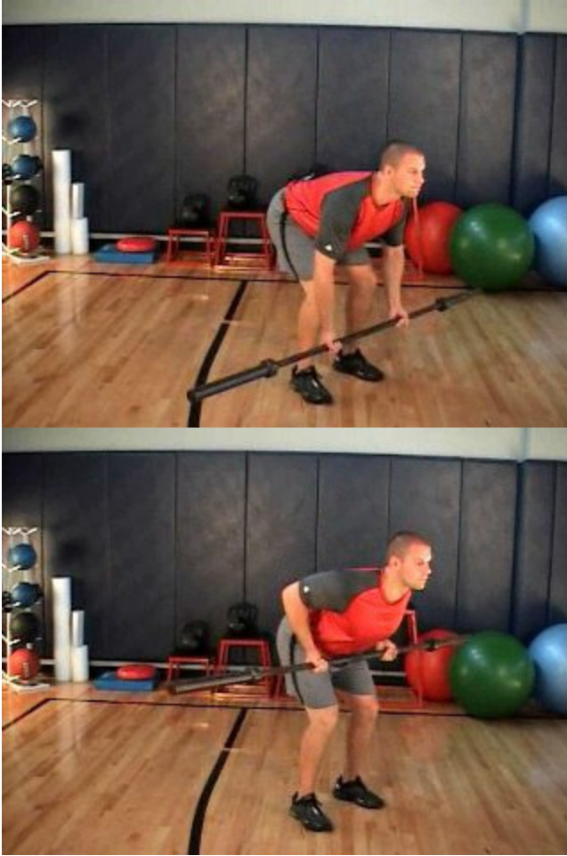
Dumbbell Bench Press Variations