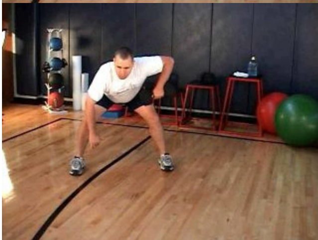
Barbell Row Variations