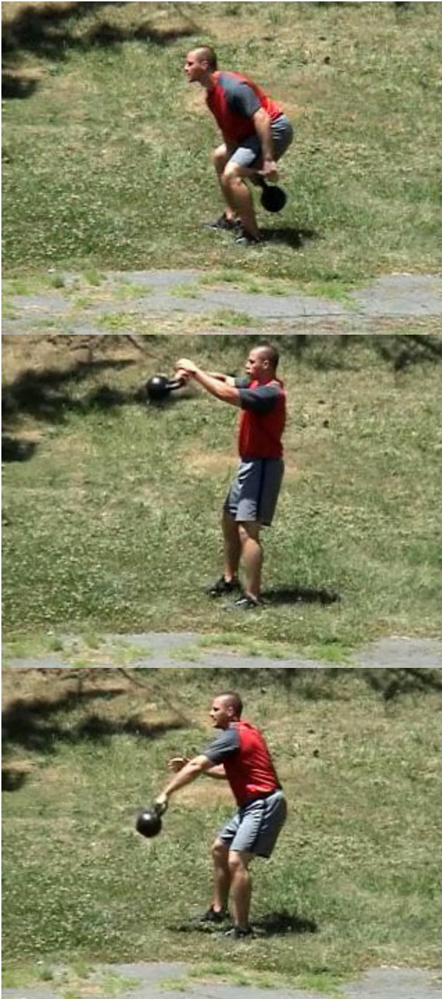
Cleans to Press