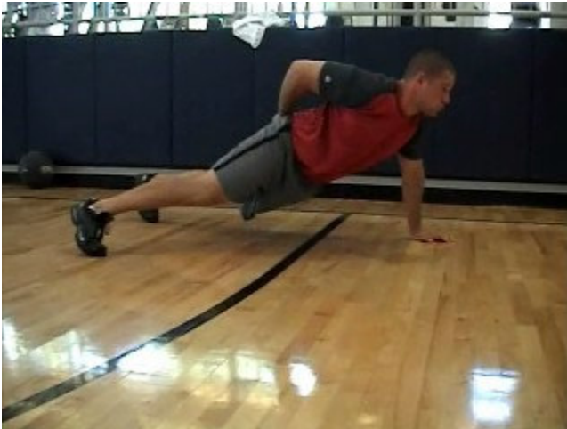
Suspended Chain Push Ups