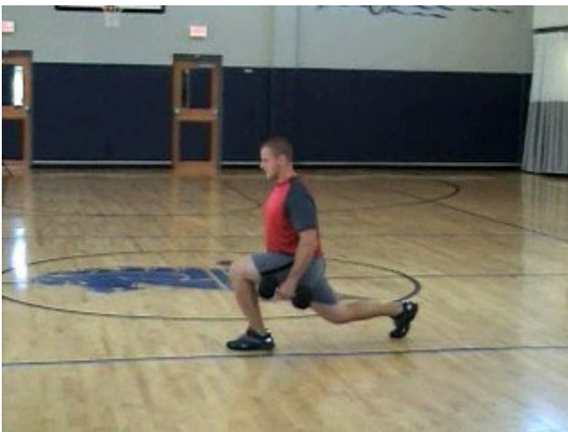
Walking Lunge to Press