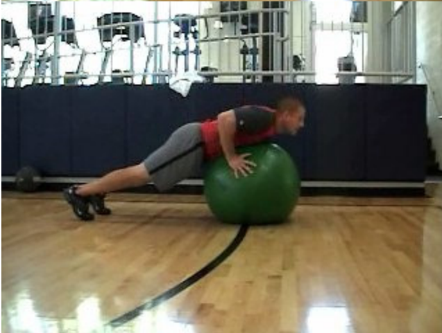
One Hand Elevated