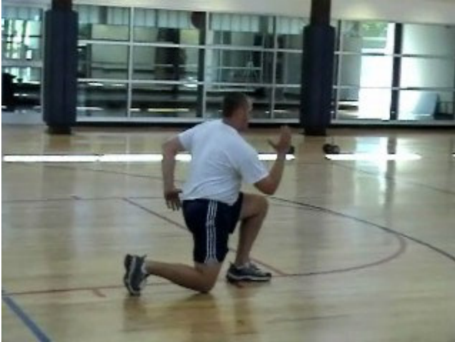
Squat Push Pull