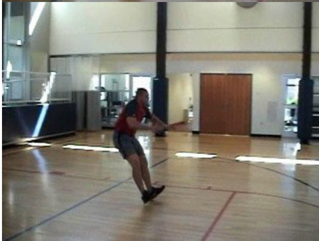
Plyometric Push Ups