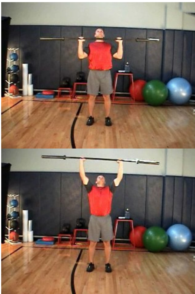
Bicep Curl Variations