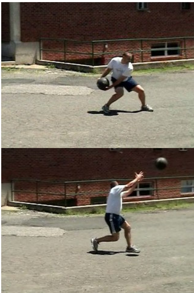
Full Rotation Throw