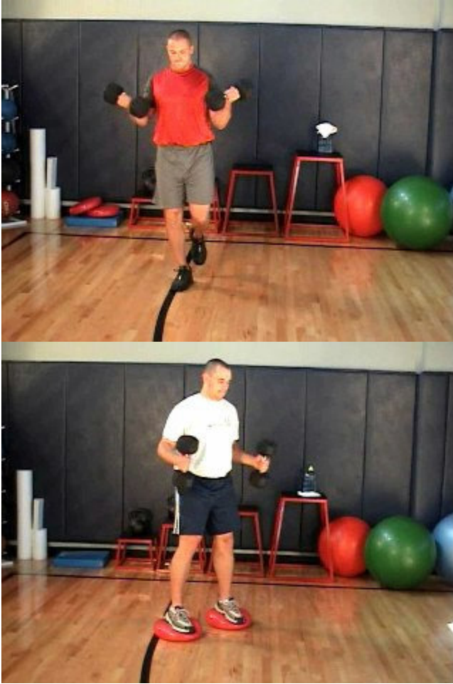
Dumbbell Curl to Press