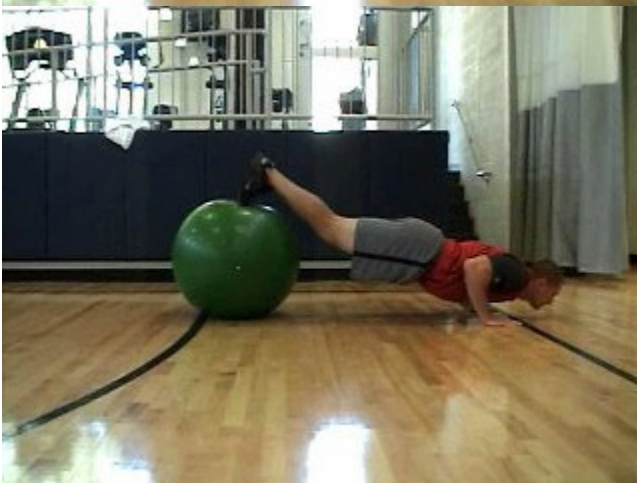
Stability Ball Push Ups