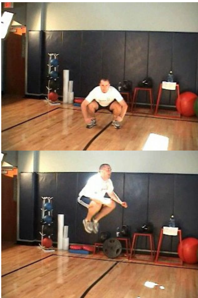
Split Squat Jumps