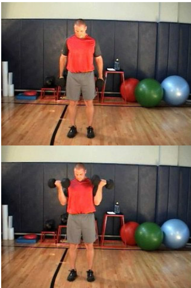
Dumbbell Hammer Curl