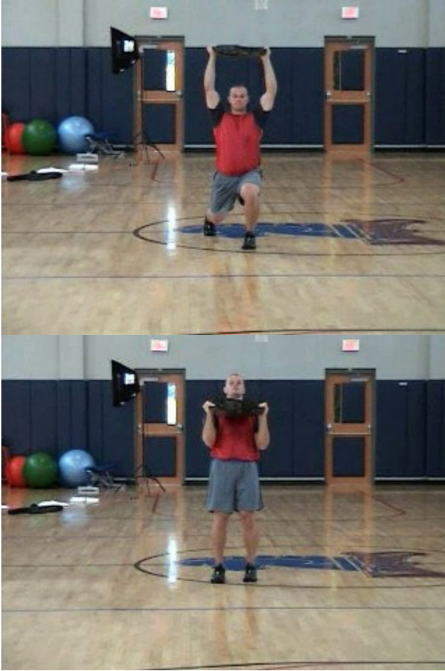
Weight Plate Squat