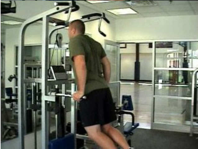
Dip Bar Leg Raises