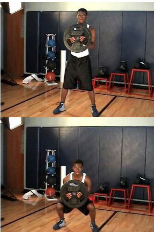
Weight Plate Wood Chop