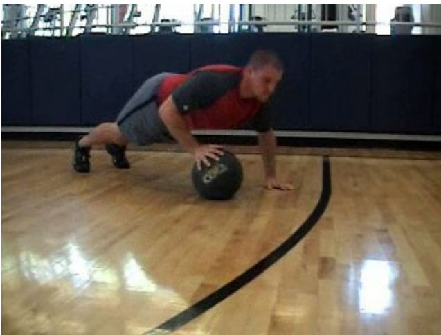
Medicine Ball Walkovers