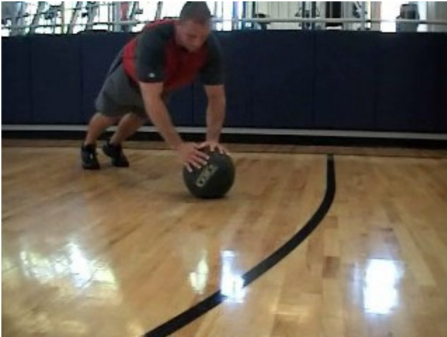
One Hand Push Ups