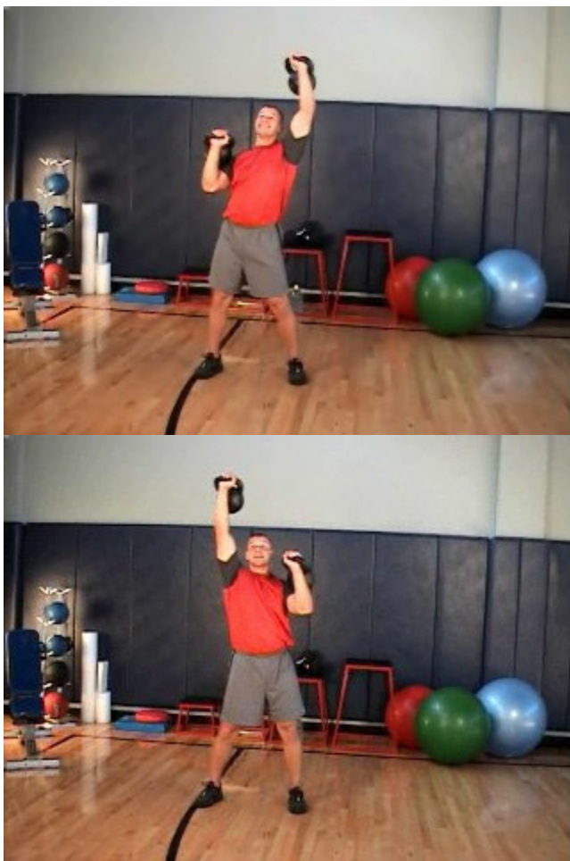
Renegade Man Maker