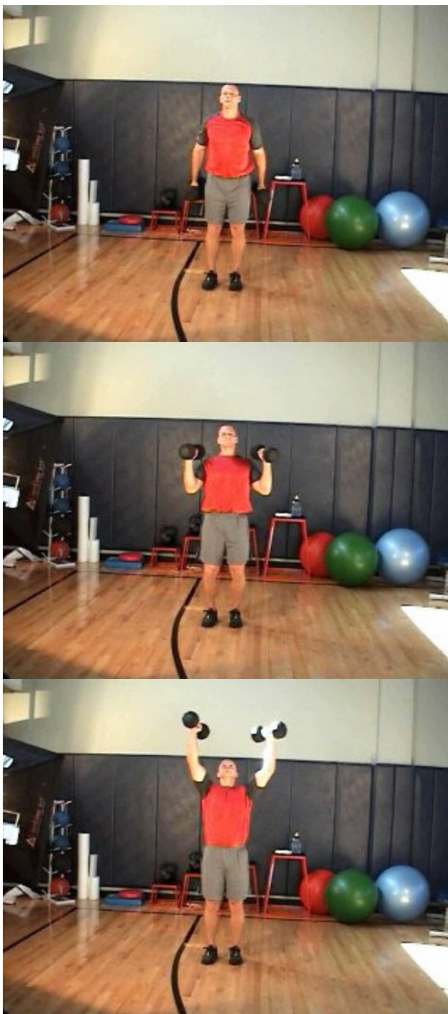
Dumbbell Squat to Press