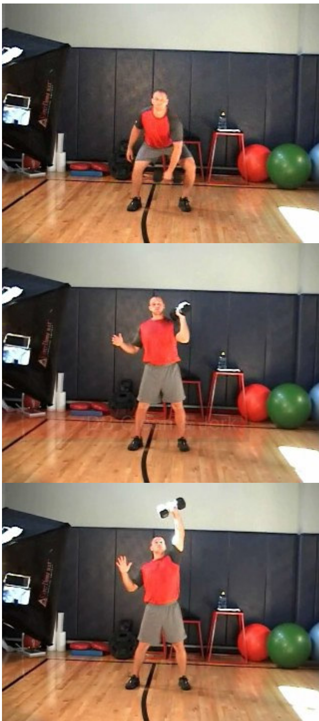
Dumbbell Row Variations