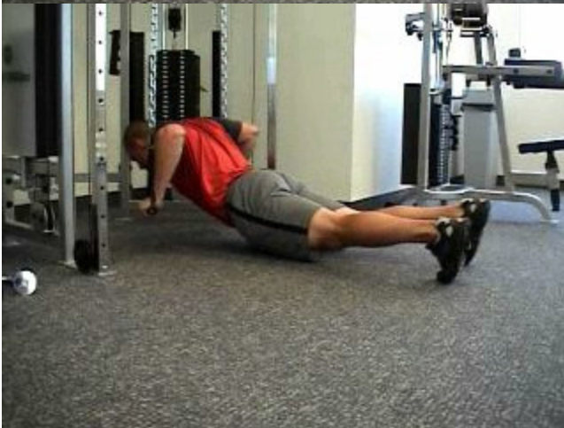
Plyometric Push Ups