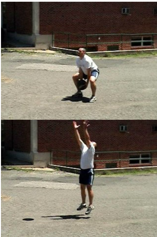
Partner Side Toss