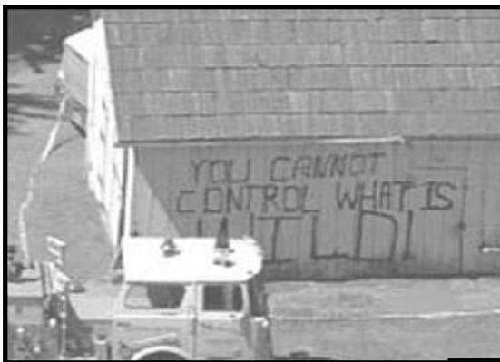
ELF slogan left behind on a building in Clatskanie, Oregon.