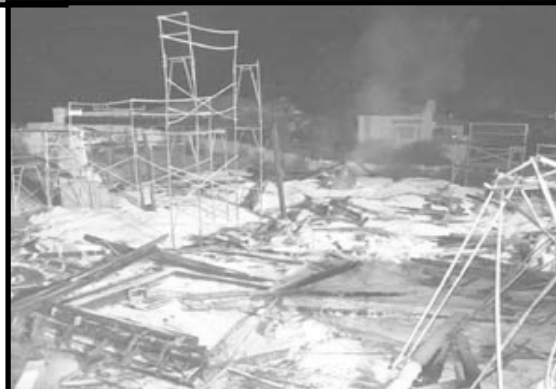
The charred ruins of what was once a "luxury home."

No one was living in the homes in Pima Canyon Estates, where East Ina Road curves into East Skyline Drive, Feldt said. They had a total value of about $5 million. One of the fires was started at the doorway of a home and the rest began on rooftops. They caused at least $2 million damage.