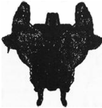
Figure 5.2: An inkblot or... ?

study of imagination, Bartlett noted that subjects asked to interpret inkblots frequently reveal much information about their personal interests and occupation. For example, the same inkblot reminded a woman of a “bonnet with feathers,” a minister of “Nebuchadnezzar’s fiery furnace,” and a physiologist of “an exposure of the basal lumbar region of the digestive system.” 2 See Figure 5.2: what does the inkblot look like to you?