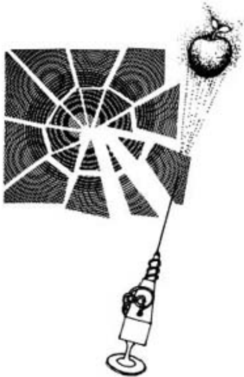
Figure 2. Unlike normal photographs, every portion of a piece of holographic film contains all the information of the whole. Thus if a holographic plate is broken into fragments, each piece can still be used to reconstruct the entire image.

gram) describes a level of reality that is not accessible to our senses or direct scientific scrutiny.