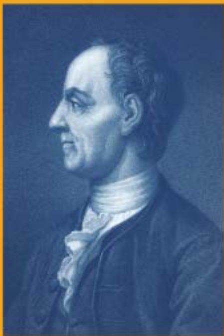
Portrait of Leonhard Euler, Artist Unknown