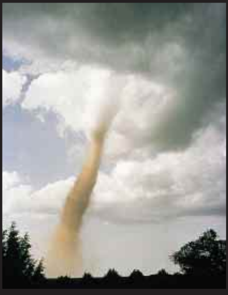
F5 TERROR: Some of the May 3 tornadoes reached F5 (261 to 318 miles per hour), the highest intensity on the Fujita scale of tornado severity ( top ). In contrast, an F0 ( bottom ), the lowest on the scale, produces winds of 40 to 72 mph.

Street after street of ruined homes revealed as much about