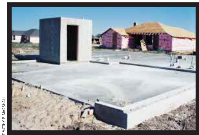
STORM BUNKER: Steel-reinforced concrete “safe rooms” can sometimes provide protection against the fury of tornado-strength winds.

nado than before, and in some cases, the quality was worse.”