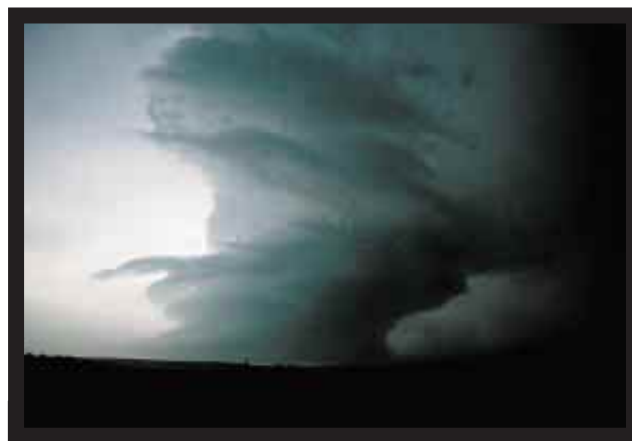
HOWARD B. BLUESTEIN

Technology is also working to protect people in their homes. Safe rooms, designed to withstand the ravages of both hurricanes and twisters, have become a hot item as storm-stricken areas begin the process of rebuilding. These rooms, which run $2,500 to $5,500, often double as closets and can be retrofitted into existing homes. They feature walls of steel-reinforced concrete, typically measuring six inches thick.