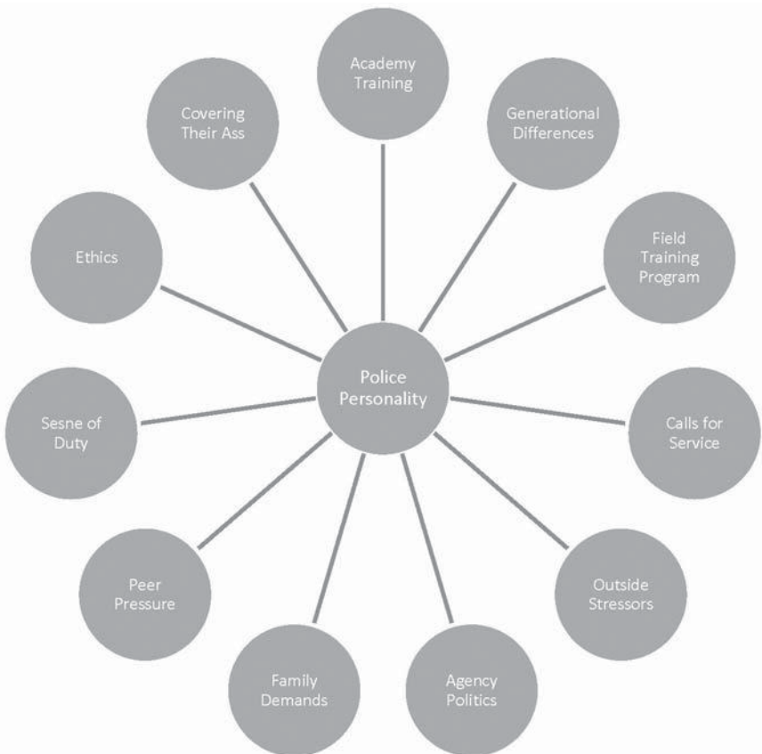
Diagram 2-2: Components That Influence the Development of the Police Personality

Hypothesis 1: The police personality is a myth because police officers come from many backgrounds with varying educational levels, life experiences, and