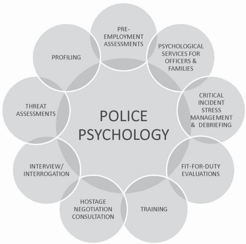
Diagram 1-1: The Specialty of Police Psychology

and the discussion of the police personality and how that personality impacts every aspect of policing. Then reflect on these two questions: How would the things I see each day impact my life professionally and personally? And would those experiences change or destroy my life as I know it?