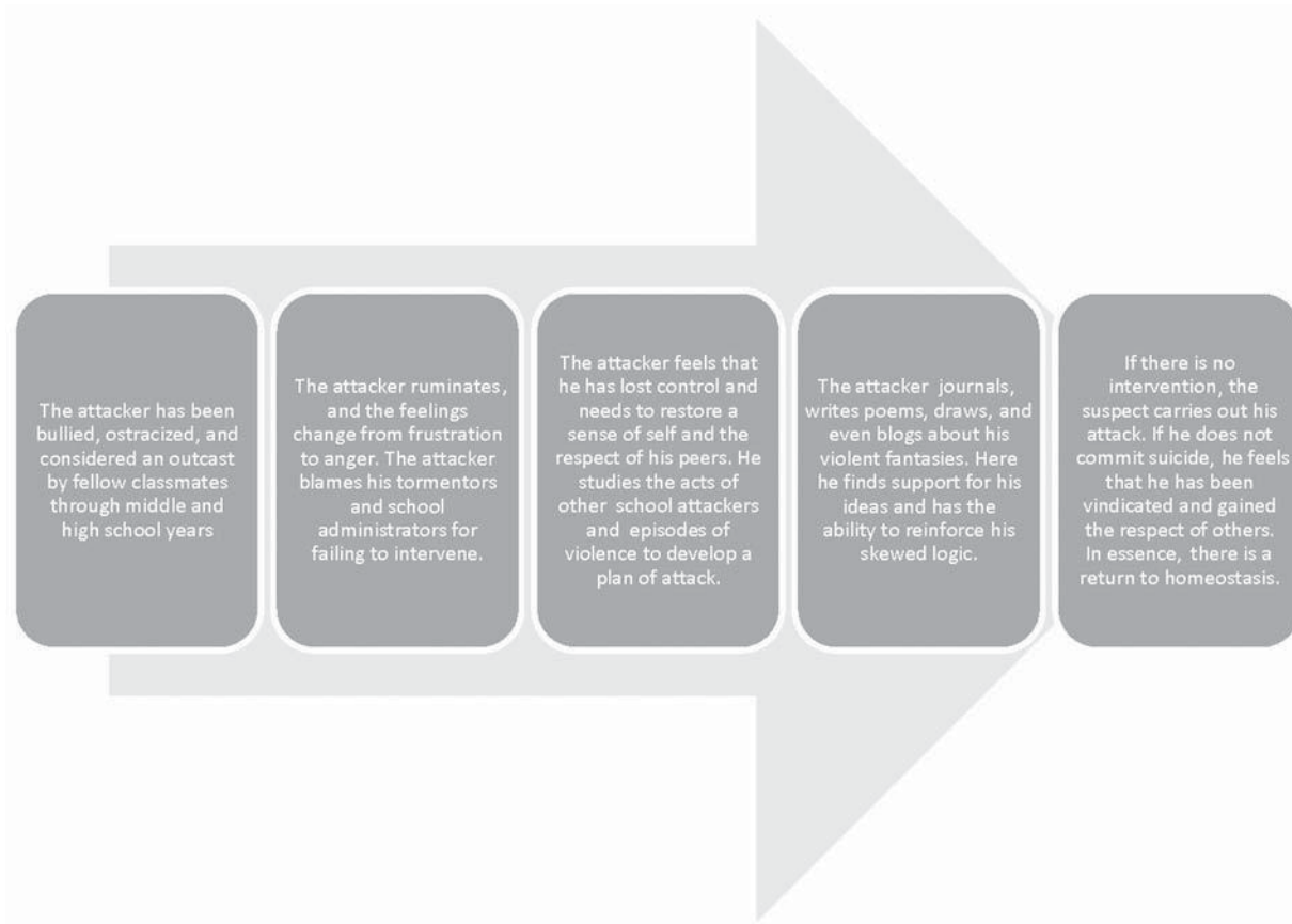
Diagram 7-1: The Anatomy of a School Shooting