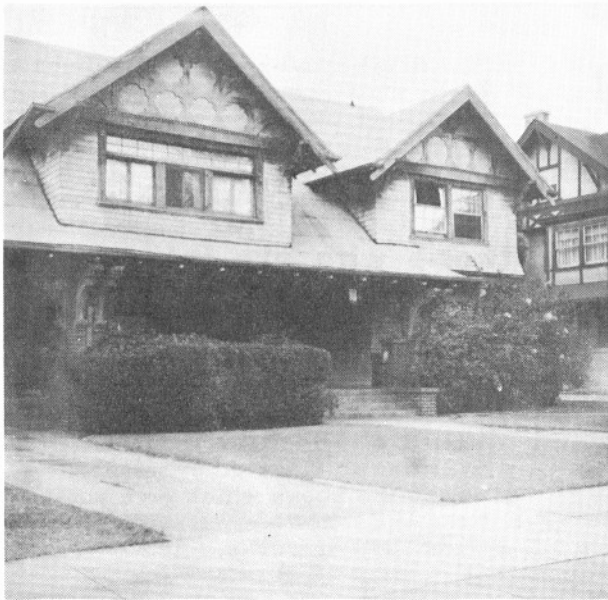
HASI headquarters in Los Angeles, Calif.