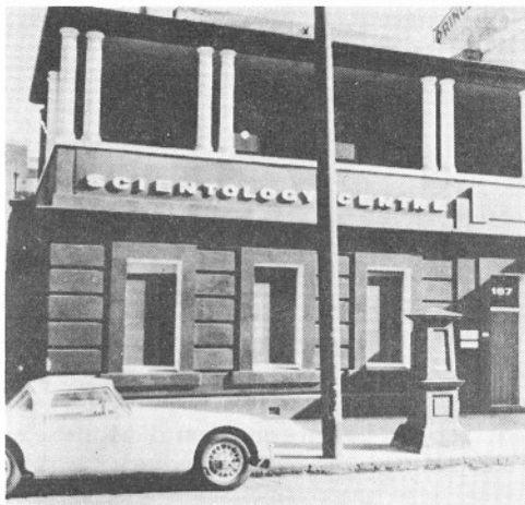
SCIENTOLOGY CENTRE HASI headquarters in Melbourne, Australia