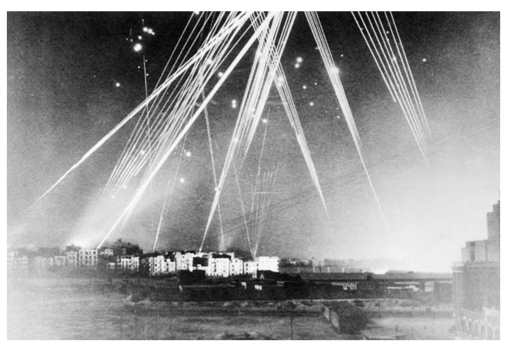
Night raid on Alexandria, November 1941. During the Second World War, Alexandria was a vital war base for the Allies fighting in the desert and the Mediterranean. Unlike Cairo, which was treated as the capital of a neutral country, Alexandria was subject to frequent Axis air raids.

British marines in the ruins of Alexandria, 1882. After much of the city was destroyed by a British naval bombardment, British troops occupied Alexandria in July 1882, in order to 'restore the authority of the Khedive'. They did not leave Alexandria until 1947, Egypt until 1956.