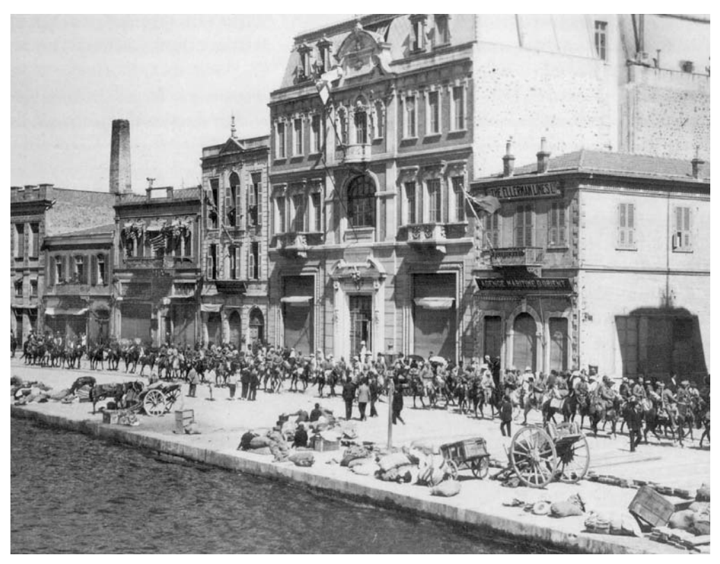
Entry of Turkish troops into Smyrna, 9 September 1922, passing the abandoned kit of the Greek army. For the next four days, until the outbreak of the fire, the city enjoyed a semblance of normality.