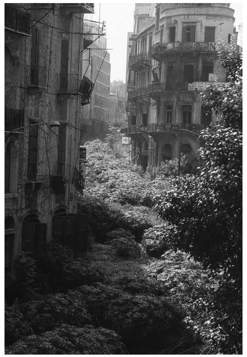
The green line, 1982. The 'green line' separating 'Muslim' west and 'Christian' east Beirut in the Lebanese civil war derived its name from the green lines marking the Israeli–Jordanian armistice of 1948, and the Greek–Turkish armistice of 1963 in Cyprus, rather than from the plants growing along it.