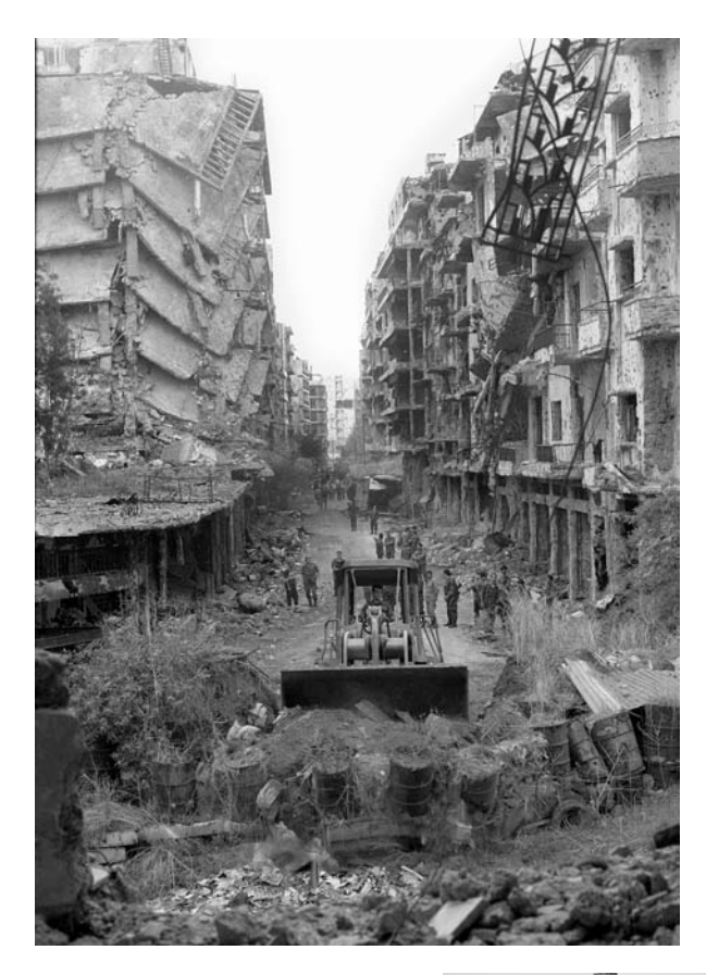
Troops supervise the removal of barricades and rubble from a street on the green line separating west and east Beirut at the end of the civil war, December 1990.

Jacques Chirac and Rafic Hariri in the Place des Martyrs, Beirut, June 1993. Behind them is a 1960 statue commemorating nationalist 'martyrs' hanged by the Ottoman authorities in 1915–16. In a modern version of the traditional connection between France and the Levant, Chirac and Hariri remained political and financial allies until the latter's assassination in 2005.