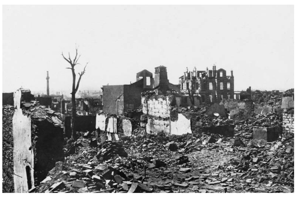
Salonica after the fire of August 1917. It destroyed 10,000 houses – mainly in Jewish and Muslim quarters – and 70,000 people were made homeless. Many Jews and Muslims subsequently emigrated. The Greek Prime Minister, Venizelos, regarded the fire as an opportunity to Hellenize the city.