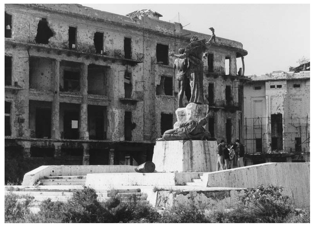
Grass grows by the martyrs' statue in the Place des Martyrs, which had once been busier than Piccadilly Circus, 1991.

Israeli bombing of west Beirut during 'Operation Peace in Galilee', July 1982. Thousands of Lebanese and Palestinians died during the 1982 war. In the foreground is the Ramlet al-Beida beach, which in peacetime is packed with bathers.