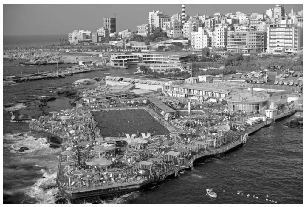
By 1968 Beirut had become the main tourist resort for the Middle East and a city of concrete.