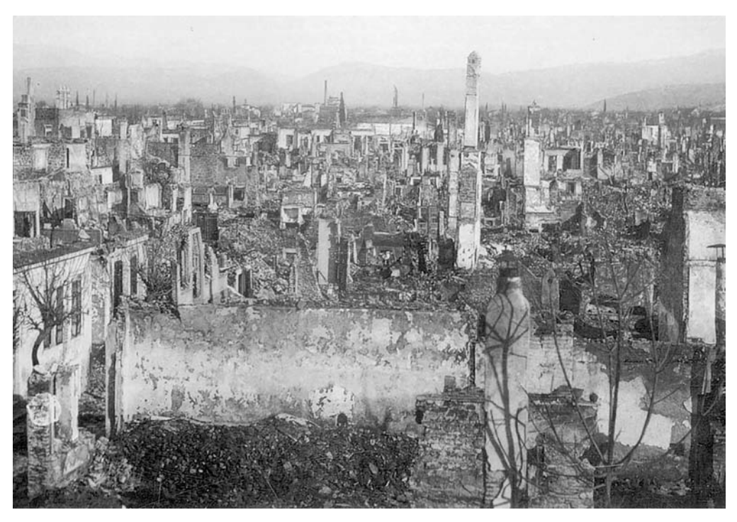
Most of the centre of Smyrna was burnt, except the Turkish and Jewish districts. It was many decades until the last blackened ruins were removed.