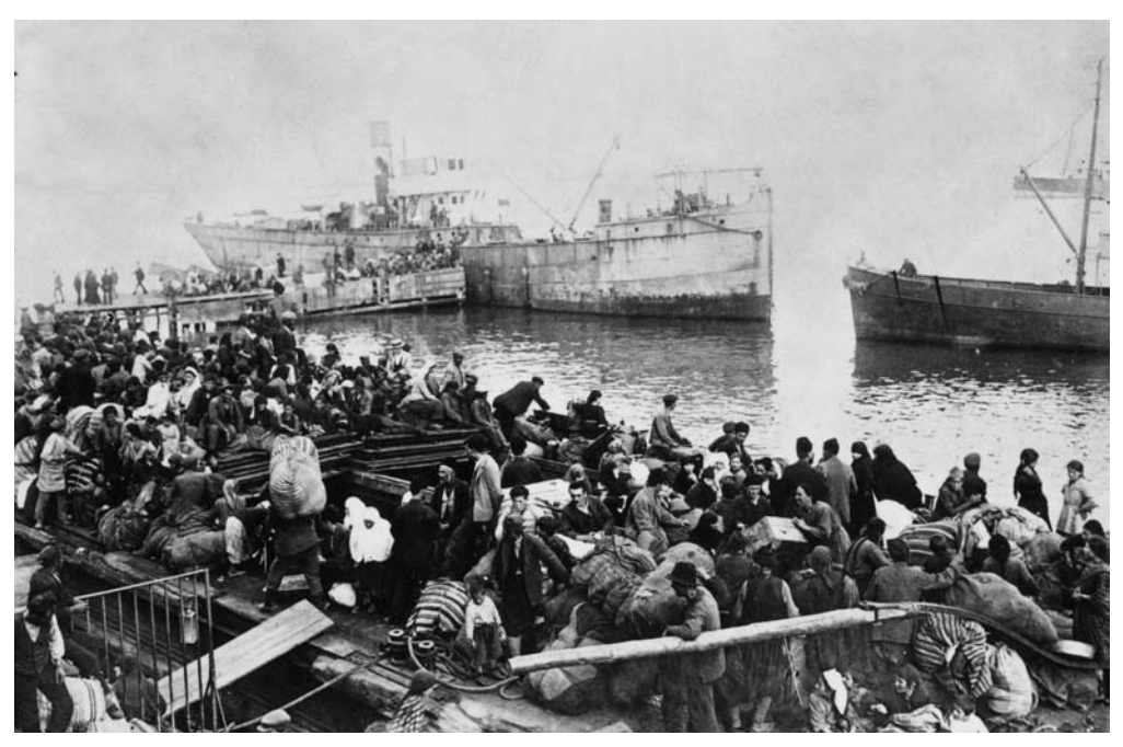
Greek refugees leaving Smyrna, end September 1922. Many men between the ages of fifteen and forty-five were deported into the interior of Anatolia.