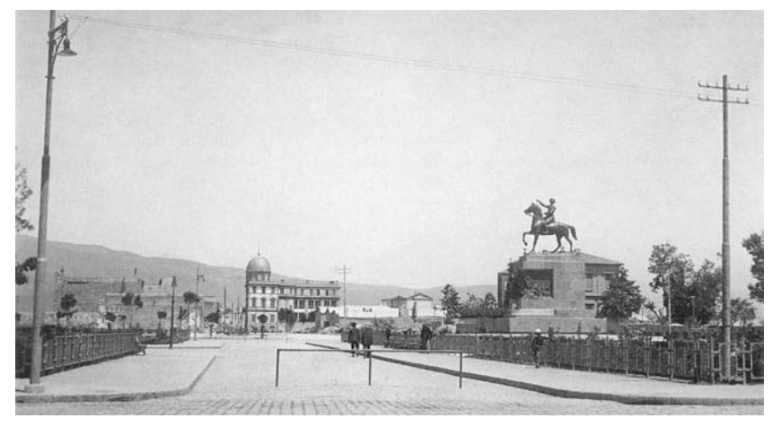
Pietro Canonica's equestrian statue of Mustafa Kemal, erected in 1931 on the ruins of Izmir, near the site of the Grand Hotel Kraemer Palace.