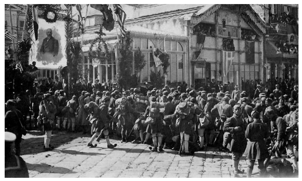
Greek troops landing on the quay at Smyrna, 15 May 1919. On the left is an image of the national hero Eleftherios Venizelos. Three and a half years later, Greek troops abandoned Smyrna to its fate.