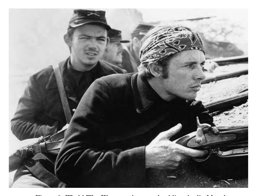
Figure 9. World War II's most decorated soldier, Audie Murphy, stars as the soldier in the 1951 M-G-M production of Stephen Crane's The Red Badge of Courage .

Even though there are, of course, many different ways of adapting Crane's The Red Badge of Courage , I hope to have indicated some of the main reasons why, in my judgment, Huston's film version is not just an interesting film but also a fine adaptation. As Stam has observed, an