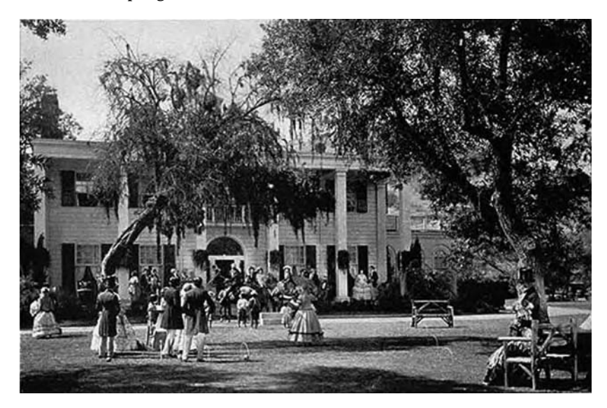
Figure 5. Guests at the Shelbys' plantation for the wedding of Eliza and George. This is the opening scene of the movie as released.