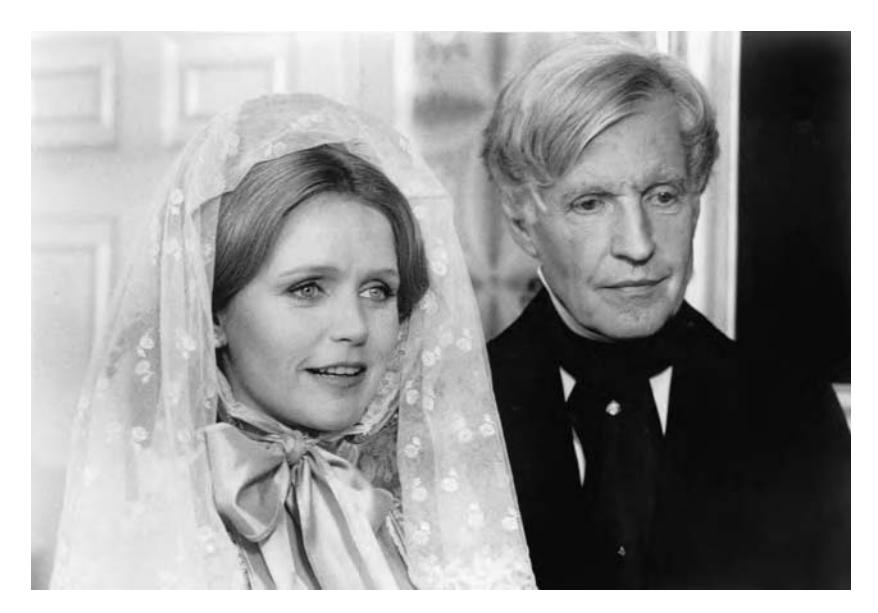
Figure 11. The Europeans is a costume drama in the heritage film tradition, a nuanced exploration of difficult personal relationships and conflicting social values. A 1979 Merchant/Ivory production.

The fact that the film ends with the suitably partnered Brand and Charlotte, walking and reading outdoors in the late autumn, acts with a telling symmetry as we recall how Gertrude, having dismissed Brand, in the same alfresco beauties of a year ago, had gone inside to receive Felix.