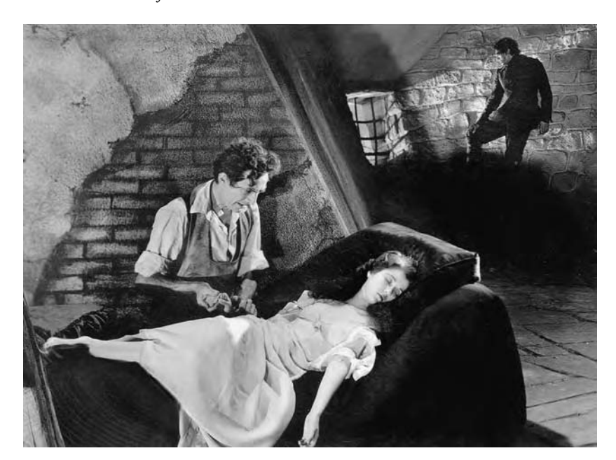
Figure 3. Universal Pictures' 1932 production of Edgar Allan Poe's Murders in the Rue Morgue shows strong influence from German Expressionism in its art design and themes.

issues raised in the original texts. This provides an opportunity to see how those debates have developed over the past century and a half or so, and how they have been recapitulated and reframed in very different sociohistorical contexts.