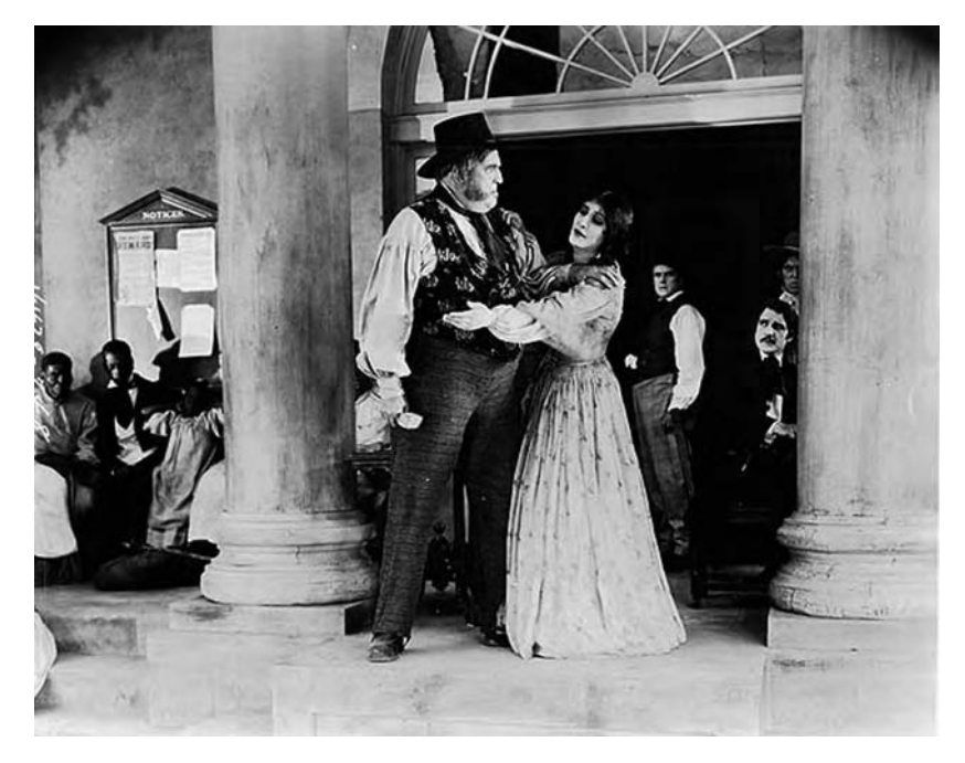
Figure 4. Cassy being sold at auction in New Orleans, and separated from her child Eliza. This is the original opening scene of Universal's 1927 Super-Jewel production of Uncle Tom's Cabin.

ills of white folks while locked up on The Green Mile (a 1999 nominee for Best Picture), he is called John Coffey. When as an inner city black teenager he teaches a suburban white girl to dance while healing her soul (in MTV's 2001 box-office smash Save The Last Dance ), he is called Derek. This list, the list of movies which use the formula that Stowe established in Uncle Tom's Cabin for defining the role of the African-American, no matter how harshly constrained his own life is, as serving the emotional or spiritual needs of white folks, could go on and on. Our movies show few signs of freeing themselves and us from this sort of Tomming. It survives because it fits so well the repressions and fantasies that white audiences continue to bring to any American relation of race.