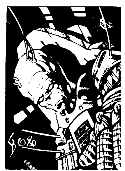
A Shock Resistance CR involves rolling 1d20, with the character avoiding the effects of shock if the 1d20 result is equal to or lower than his SR number.

Shock Resistance arises from a PC's Constitution. The SR is found by using the Constitution score. No character will have a Shock