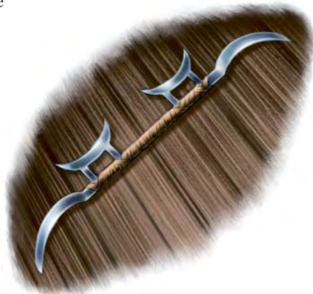
Qian Kun Ri Yue Dao

For general rules governing Expert Skills, see the Basic Set . A new Expert Skill is important in Martial Arts games: