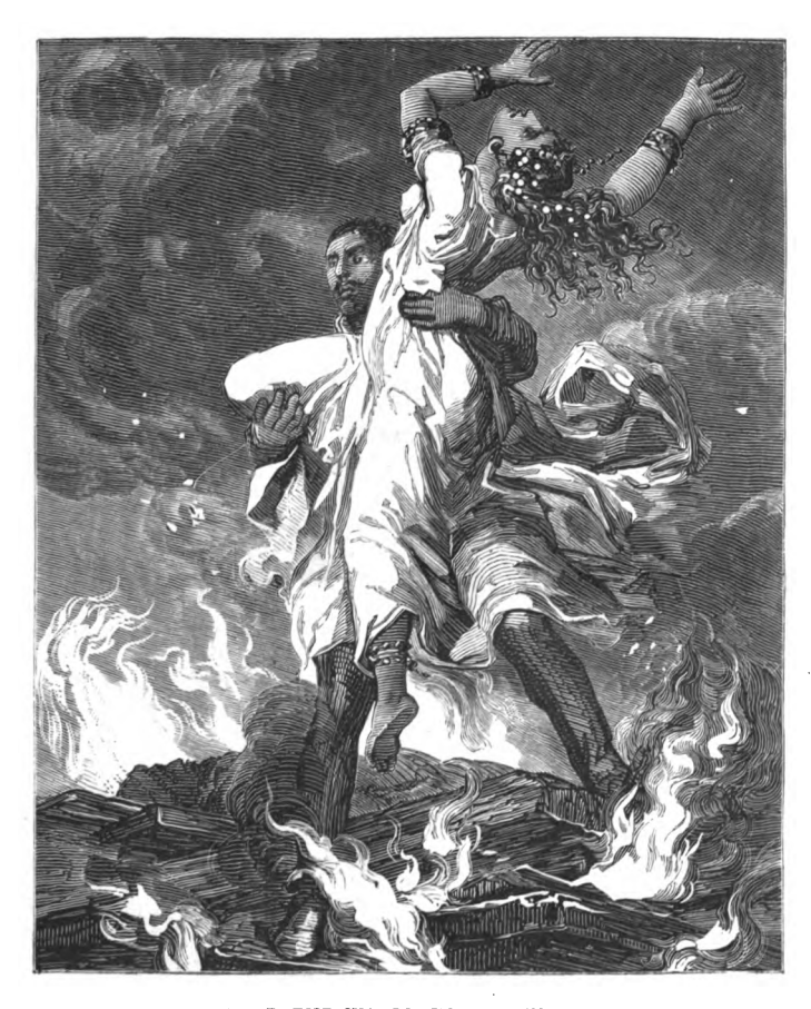
ROUND THE WORLD IN EIGHTY DAYS.