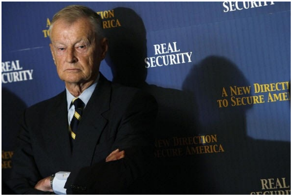
Reptoids Left Eye