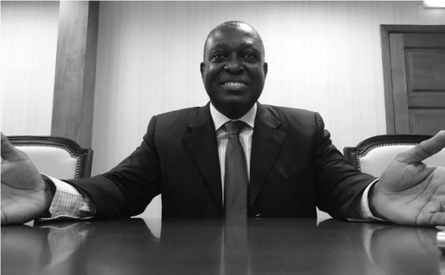
Manuel Vicente, Angola's Mr. Oil and a key man in the ruling Futungo's privatization of power. "I'm a Christian guy," he says. "It doesn't work if you are okay and the people around [you] have nothing to eat. You don't feel comfortable."