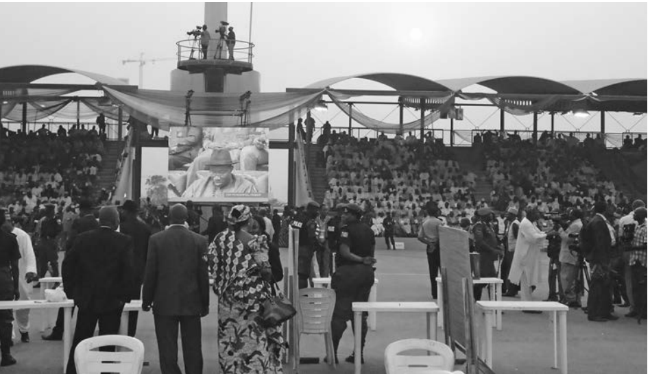
The People's Democratic Party's presidential primary is a high point in the calendar of Nigeria's patronage politics. "It's not a political party," says a veteran human rights activist. "It's a platform to seize power and then share the resultant booty."