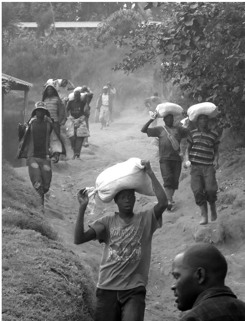
The sacks of coltan that porters carry down the mountainsides of eastern Congo flow into a conflict economy that underpins decades of strife. But efforts to clean up the trade risk undercutting one of the few livelihoods in a region stalked by hunger.