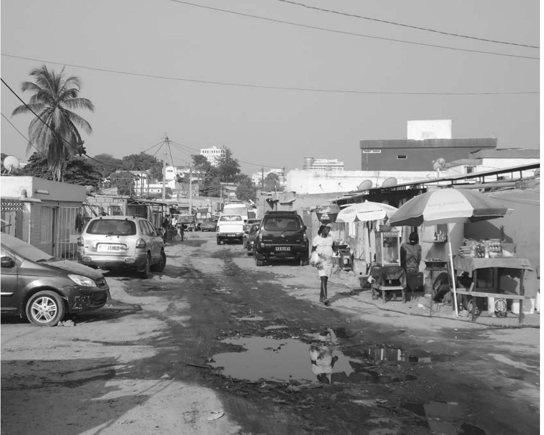
The Chicala slum sits between the presidential complex that houses Angola's ruling clique and the Atlantic waters under which lie some of the world's richest oil reserves.