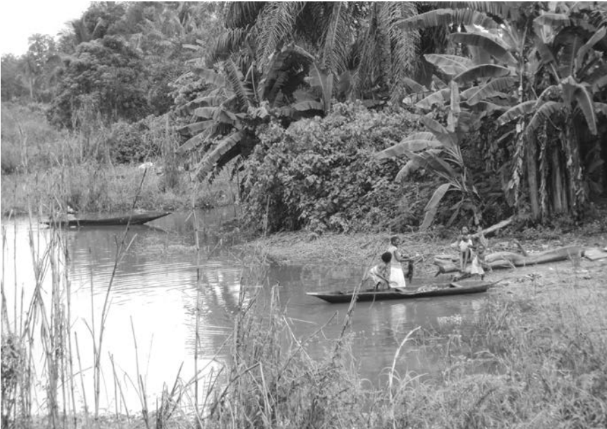
Crude oil has poisoned the waterways where inhabitants of the Niger Delta wash, drink, fish, and worship.