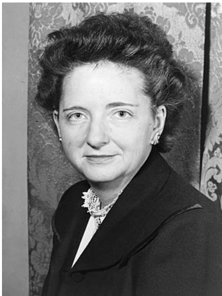
Self-styled “spy queen” Elizabeth Bentley converted from Communism to Catholicism in 1948 under the tutelage of Fulton Sheen.

Other converted Communists joined Sheen’s acolytes with the release of The God That Failed in 1949. Edited by the British politician Richard Crossman, it featured six essays by either former Communists or former Communist sympathizers—most notably British writer Arthur Koestler and American novelist