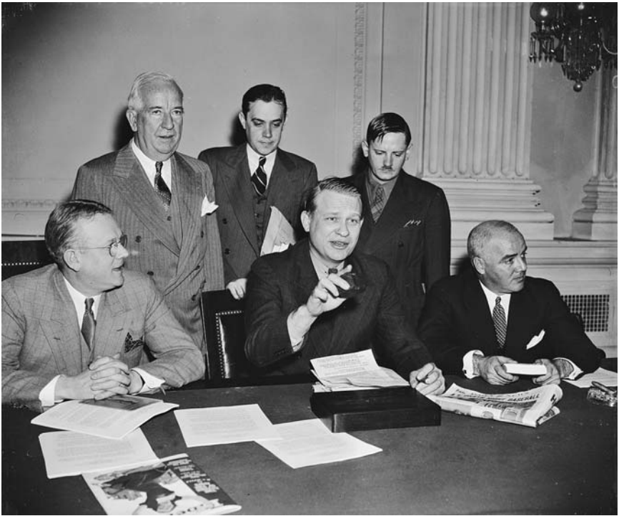
Martin Dies (seated, center) presided over one of the most criticized congressional committees in history, providing a platform for witnesses to explore the religious dimensions of Communism.

Not only did HUAC testimony shed light on purported Communist activities in the United States, its witnesses publicly elucidated a Communist worldview. Not surprisingly, they focused on Communist enmity toward religion. John P. Frey, president of the Metal Trades Department of the American Federation of Labor and an heir to Samuel Gompers's antiradical tradition, asked Dies if he could discuss the Communist hatred of religion. After receiving permission, he introduced a series of posters from the USSR. The first depicted the Red Army saving the world from the Roman Catholic Church, Mary and baby Jesus hypnotized by the allure of capitalism, and a comrade breaking an Easter egg. Another portrayed the Soviet industrial machine sweeping away God to create a heaven on Earth. Frey followed his shocking visuals by reading the dismayed