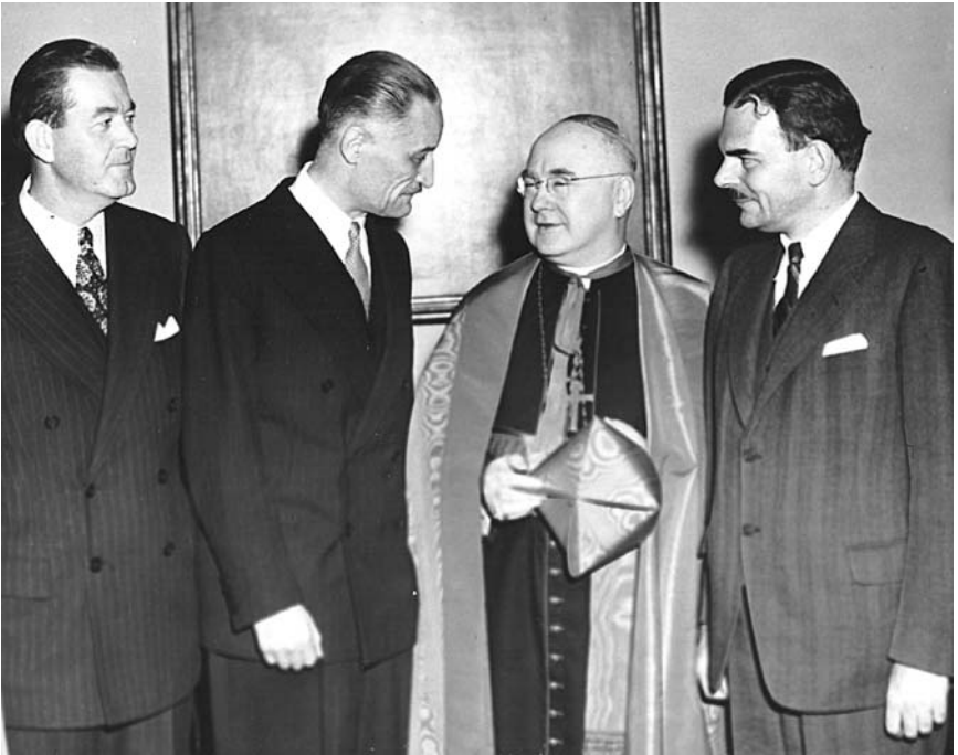
Francis Cardinal Spellman (third from left) greeting political officials including New York Governor Thomas E. Dewey (right). With a chancery nicknamed "the Powerhouse," Spellman made his home at the nexus of politics and religion, becoming a fierce advocate for religious awakening in the name of national security.

Pius XII began receiving reports of religious persecution from Church officials in Eastern European countries under Soviet control shortly after Germany's surrender. In September 1945, Poland's puppet government abrogated the 1925 treaty that governed relations between the Vatican and eastern Europe's most Catholic nation. Arrests and deportations followed. In many nations now behind the Iron Curtain, the Church was the strongest, and in some cases the only, institution with the resources to oppose newly installed Communist governments. Realizing this, the pope held an extraordinary consistory in February 1946. There he named thirty-two new cardinals, often promoting the most vehement anti-Communists. They would become his generals in the coming war, men who, in the pope's words, were "in the front lines of the church's life." Among those elevated to cardinal were Francis Spellman of New York and the Polish bishop Adam Sapieha, who would join with other anti-Communist heavyweights like Archbishop Aloysius Stepinac of Yugoslavia and Joseph Cardinal Mindszenty of Hungary in leading the Church's crusade. 64