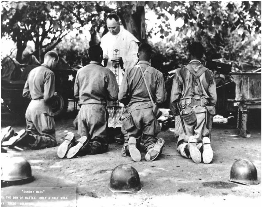
American soldiers celebrating Catholic mass during the Korean War in 1950. That year alone, Army chaplains conducted more than 200,000 religious services.