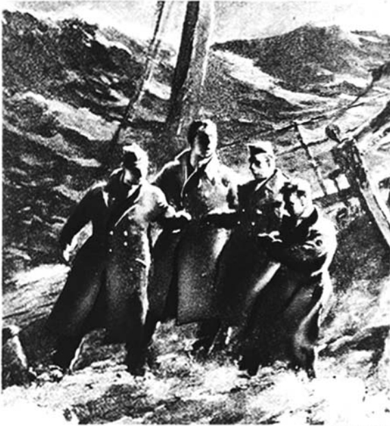
ARMY TRANSPORT DORCHESTER TORPEDOED BY SUBMARINE, FEBRUARY 3, 1943

A PRIEST, A RABBI AND TWO MINISTERS WHO GAVE THEIR LIVES THAT OTHERS MIGHT LIVE