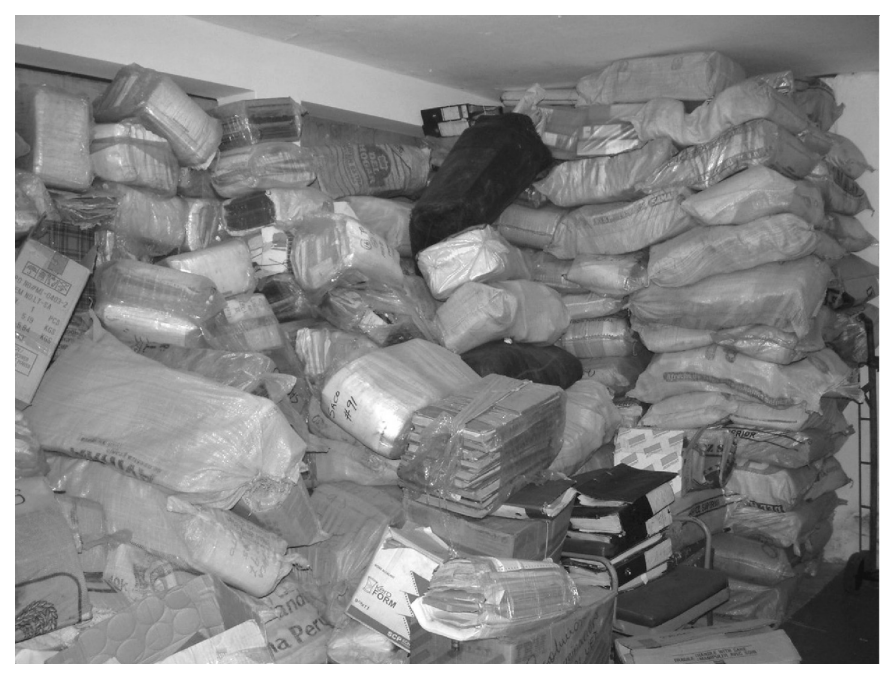
Documents stored in the archive of the municipality of Independencia, Peru, August 2004.

disclosure law. A third will be adequate resources for administering the law. Proponents of disclosure laws have sometimes been reluctant to discuss the potential burden of administering new laws, but they can be substantial if the law is to be applied properly. Staff need to be trained so that they know how to receive and respond to requests. In departments likely to receive a large number of requests, special offices may need to be established. The processing of requests will require some officials to retrieve records and review them to separate those that are sensitive from those that are not. Lawyers may be needed to give advice on the interpretation of exemptions in the law. Copies of documents containing sensitive material will have to be made, and the sensitive portions blacked out.