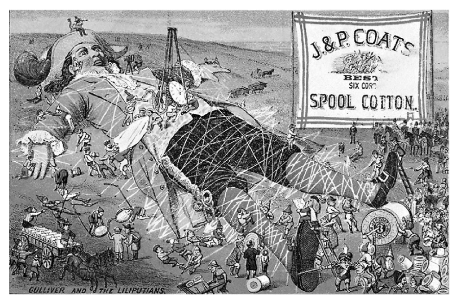
This image, first used in the nineteenth-century advertising of a British thread manufacturer, was reproduced in the Bush administration's 2003 budget to illustrate its frustration with legislative checks on executive authority.

that, you can't do this, you can't do that," where your flexibility is just – it's like Gulliver, with a whole bunch of Lilliputian threads over them. No one thread keeps Gulliver down, but in the aggregate, he can't get up. And that is where we are.<sup>40</sup>