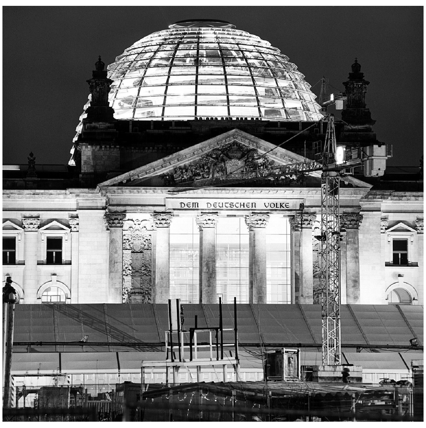
The massive glass cupola of the renovated German Parliament, opened in 1999. The British architect Norman Foster said that he intended the Parliament to be "transparent, its activities on view." The cupola contains an observation platform "allowing the people to ascend above the heads of their political representatives."