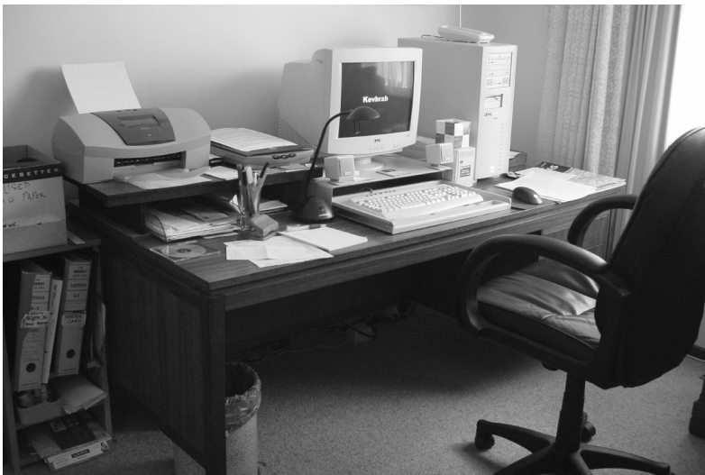
Figure 3.5 The 'digital shed'