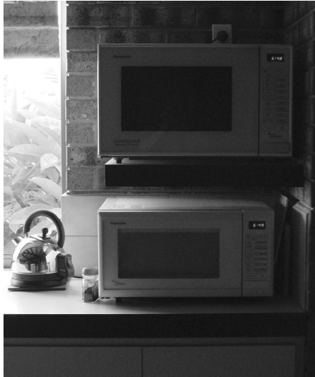
Figure 3.1 Microwaving change

This was the complex response to the first question. I thought it would be an easy one. Instead, her answers revealed how she was becoming trapped and limited by her own definitions of technology. While she manages technology every day, these appliances are not included in her definition.