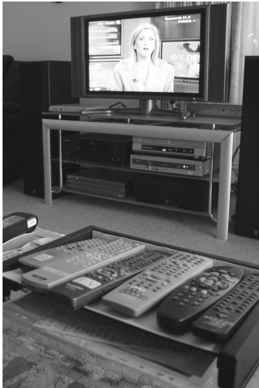
Figure 3.4 Technology in the lounge room

DB: I would after I had the knowledge of someone teaching me about the computer. I'd want someone to come in and teach me everything and I'd write it all down as he went. I'd need to know exactly what I was doing.