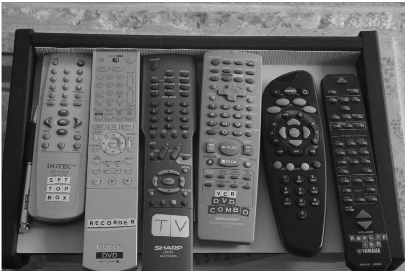
Figure 3.3 The complexity of access

This was a disaster of a 'system'. It took at least five minutes to set up the system to get a picture. I still find it incredibly difficult to work the multiple