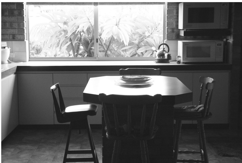
Figure 3.2 Domesticating technology