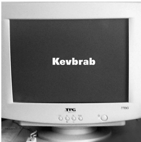
Figure 3.8 A mode of exclusion

TB: So you don't really have an answer to your own question.