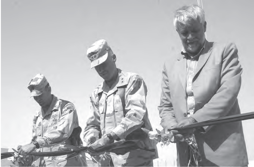
Figure 6.1 U.S. Military Officers and the Afghan Provincial Governor Inaugurating a Provincial Reconstruction Team in 2004