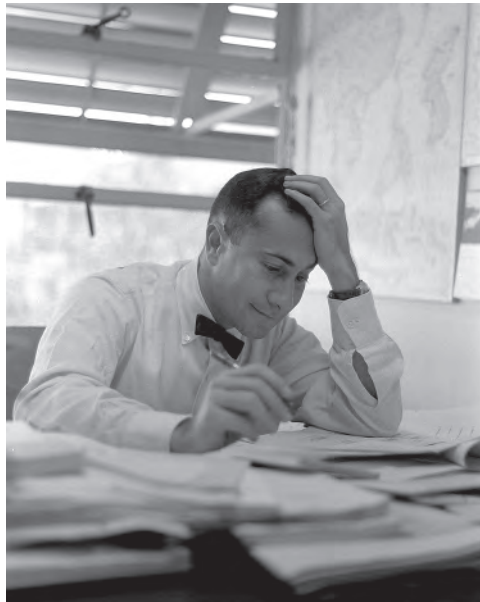
Figure 4.1 RAND Economist Charles Wolf, Jr.

In 1965, as the United States crossed the Rubicon of deploying ground forces to Vietnam, RAND economist Charles Wolf, Jr. (shown in Figure 4.1), circulated a paper questioning the validity of one of the central precepts of HAM theory. Wolf argued that popular support was far from necessary for insurgents in lesser-developed countries. He pointed out: “From an operational point of view, what an insurgent movement requires for successful and expanding operations is not popular support, in the sense of attitudes of identification and allegiance, but rather a supply of certain inputs . . . at a reasonable cost, interpreting cost to include expenditure of coercion as well as money” (1965, p. 5).