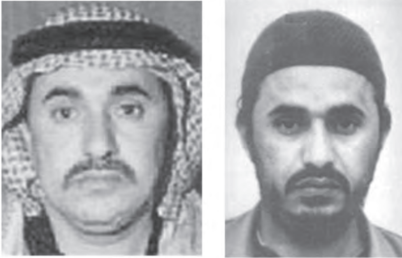
Figure 6.3 The Rewards for Justice Program Currently Focuses Only on High-Level Terrorists and Insurgents Such as the Late Abu Musab Al-Zarqawi