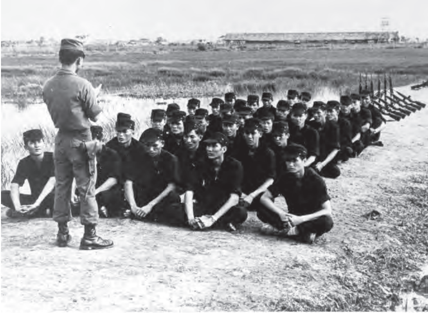
Figure 5.5 The Vietnamese Civil Guard, an Early Paramilitary Dedicated to Providing Local Security for COIN