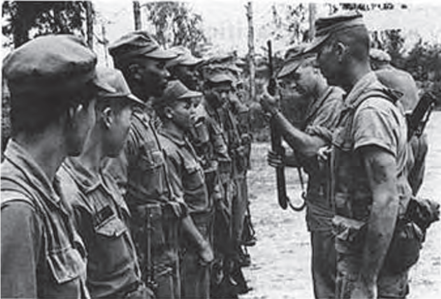
Figure 5.2 A Marine Captain Inspecting a Combined Action Unit That Fully Integrated Vietnamese and U.S. Personnel at the Squad Level