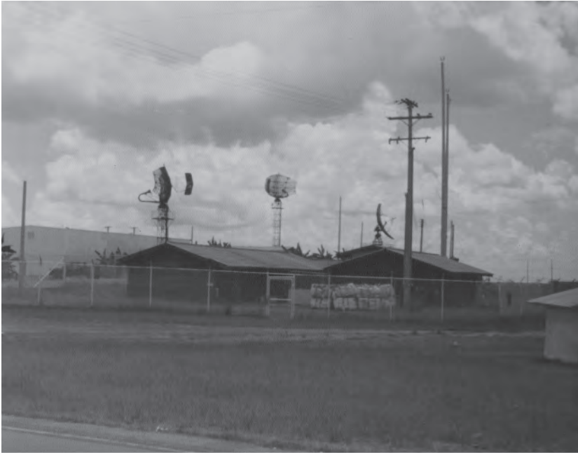
Figure 5.4 Nakhon Phanom Royal Thai Air Force Base