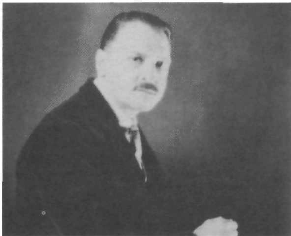
Somerset Maugham-MI6 special agent to Kerensky.