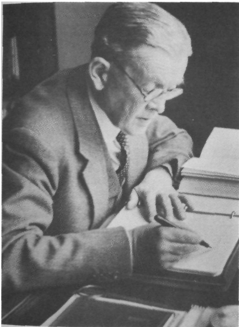
Bruce Lockhart-MI6 controller of Lenin and Trotsky.