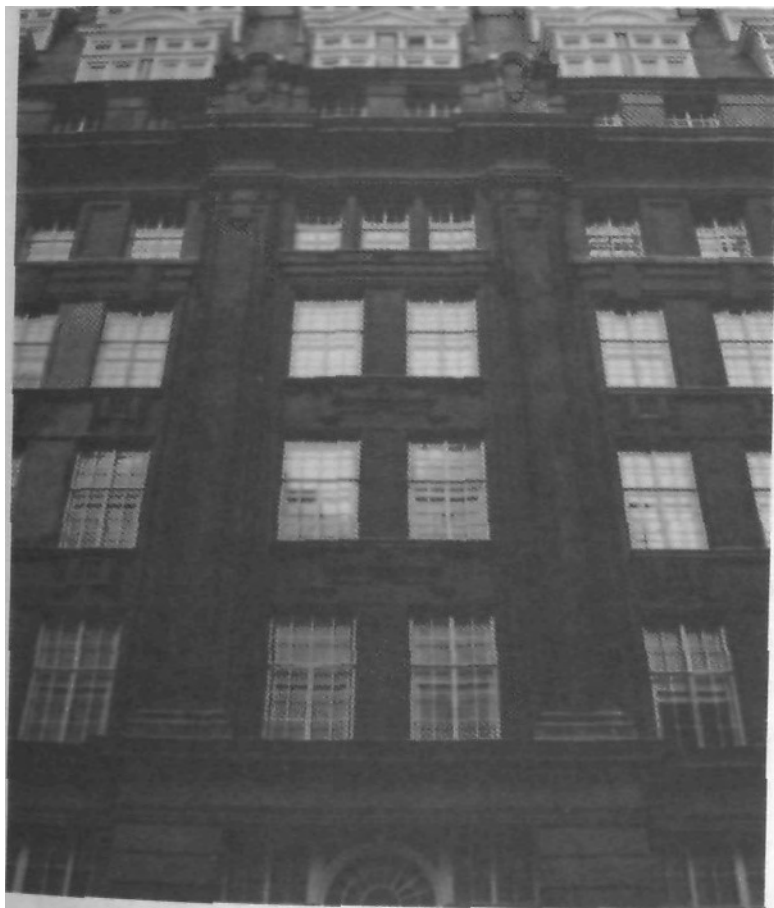
MI6 Headquarters London.