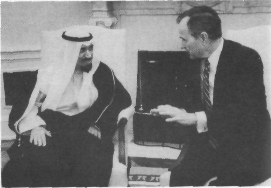
Former U.S. President Bush and Emir Al-Sabah.