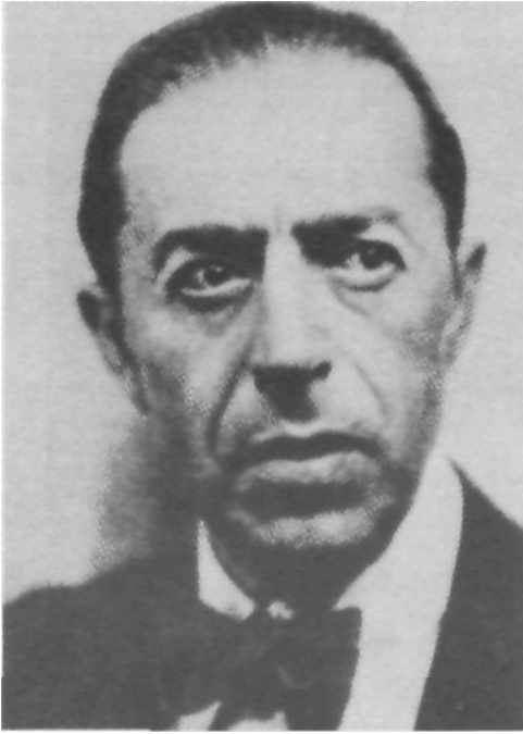
Sydney Reilly-economic specialist MI6.