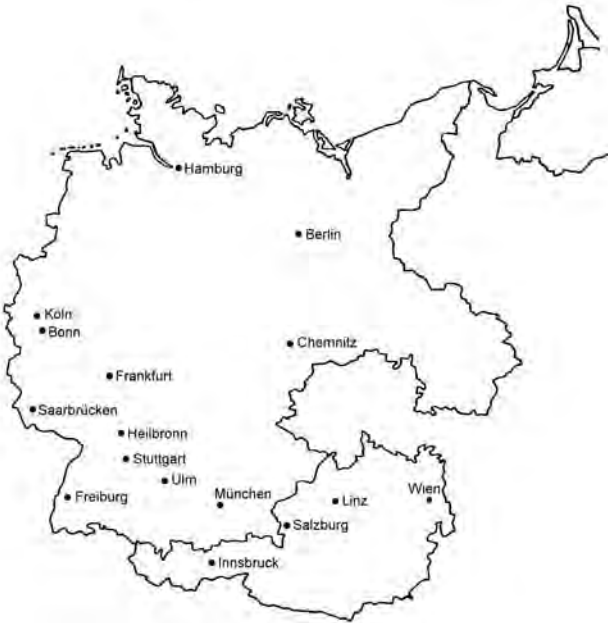
A map of Germany showing the major cities where the leaflets were distributed

Our people stand ready to rebel against the National Socialist enslavement of Europe in an impassioned uprising of freedom and honor.