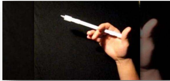
Pen Spinning Fundamental Tricks-Sonic

The next trick is Sonic , which is harder to master for beginners than the first two tricks. “Sonic” means that you have to move the pen from one finger position to another finger position as quickly as possible. It is better for you if you can move as fast as sound transmission although it is an impossible mission. Ok, you can learn this trick with the detailed tutorial in this blog “ Pen Spinning Fundamental Tricks-Sonic ”.