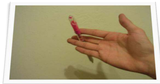
Pen Spinning Fundamental Tricks-Charge

The last one trick is Charge . Do you master the three tricks expertly above? And do you want to learn more advanced pen spinning tricks? Don't be in a hurry, you'd better learn all the tricks step by step especially for the fundamental ones. Here the trick Charge does not involve spinning the pen around any fingers or any body parts, but it is the hardest fundamental trick for beginners to master in short time. See more from “ Pen Spinning Fundamental Tricks-Charge ”.