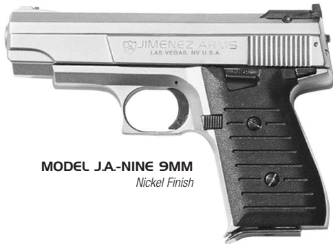
MODEL J.A.-NINE 9MM Nickel Finish