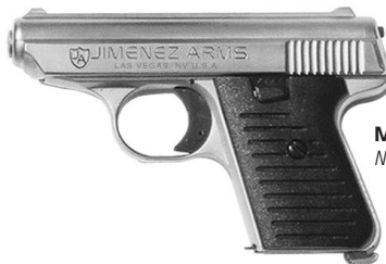
MODEL J.A.-22 L.R. Nickel Finish