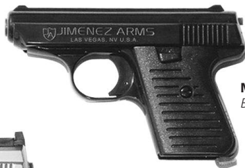
MODEL J.A.-25 Black Finish