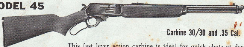
Carbine 30/30 and .35 Cal.

This fast lever action carbine is ideal for quick shots at deer, bear and other similar game. The strong receiver, action parts, and barrel will stand many years of hard use. Magazine holds 6 shots and 1 in chamber of barrel makes it a 7 shot carbine. Equipped with bead front sight and open rear sight with adjustable elevator for different ranges. Has walnut forearm and stock fitted with durable hard rubber buttplate. Top of receiver has 4 holes drilled and tapped for telescopic mounting, also 2 holes on left side of receiver for popular peep sights.