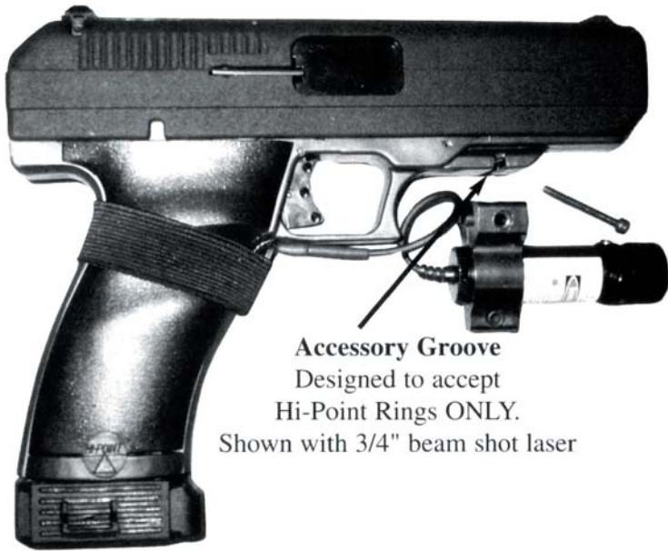
Accessory Groove Designed to accept Hi-Point Rings ONLY. Shown with 3/4" beam shot laser