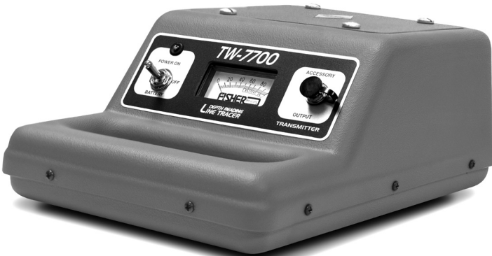
The TW-7700 Transn

WARNING: ELECTRIC SHOCK HAZARD: qualified personnel only.