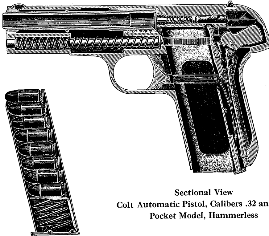
Sectional View Colt Automatic Pistol, Calibers .32 and .380 Pocket Model, Hammerless