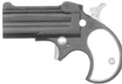
MODEL C22, C22M, C25, AND C32