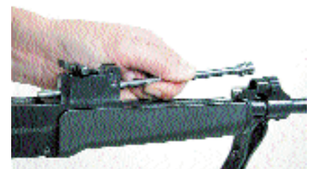
Illustration # 9