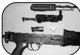
Illustration # 10

The Century VZ2008 rifle disassembled into its major components for routine cleaning and maintenance.