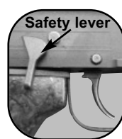
Illustration # 4

Safety lever in vertical "SAFE" position.