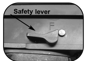
Illustration # 3

Safety lever in horizontal "FIRE" position.