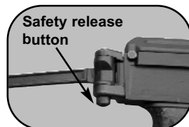
Illustration # 5

To fold or open the shoulder stock, press in (upward) on the stock release button.