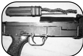
Illustration # 7

The receiver cover with attached springs removed.