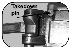
Illustration # 6

To begin disassembly, withdraw the retainer pin on rear of receiver's right side.